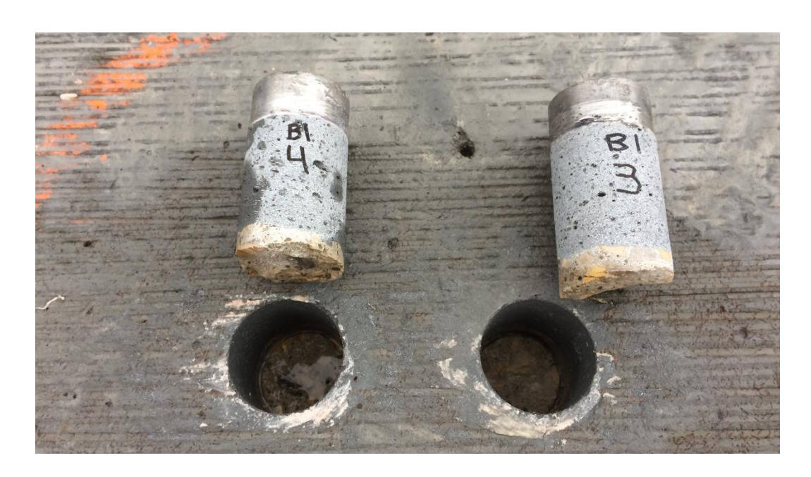
Figure 1. UHPC-Concrete Bond Test Samples After Testing