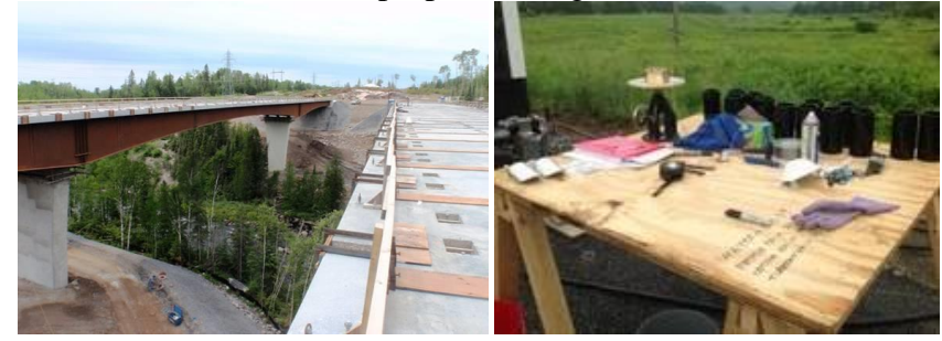
Figure 6: (left) Mackenzie River Twin Bridges – precast concrete decks with UHPC joints (Perry, Krisciunas & Stofko, 2012); and (right) on-site QA/QC equipment.

Prior to placing the UHPC material, a mini-slump test is conducted on each batch to ensure consistency of the mix. Once per day, a set of 75 mm x 150 mm (3 in x 6 in) cylinders are made in order to validate the hardened material properties (Figure 6).