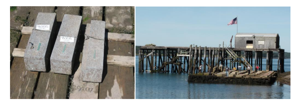
Figure 1: UHPC Prisms (left) at the US Army Corps of Engineers Treat Island Marine exposure station (right), Maine, U.S.A.

Early introduction and testing of UHPC for use in North American bridge structures and marine environments began in 1994, over 20 years ago (Perry, 2013). Raw material sourcing and formulating resulted in the preparation and placement of UHPC test prisms at the US Army Corps of Engineers (USACE) Long-Term Marine Exposure Station at Treat Island, Maine (Thomas et al., 2012). In 1996, three UHPC prisms were cast and placed on the exposure site to monitor long-term weathering (Figure 1). Subsequently, several additional sets of UHPC prisms have been cast and placed on the dock (elevation at mean tide) and are subject to twice daily tides of wet/dry and winter freeze/thaw cycles.