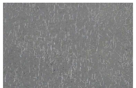
Figure 7a: UHPC made of preblended constituents. Thixotropic consistence. Surface after hardening and hydroblasting. Fibers oriented along the finisher direction