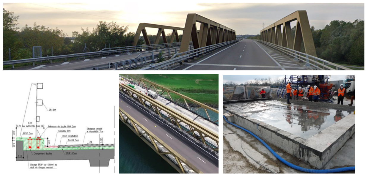
Figure 1: UHPC overlay on the Warren-type A36 bridge, substituting top of the concrete slab and ensuring waterproofing as tested on a dedicated mockup.

bituminous layers to 50 mm, while keeping the deck stiffness, the waterproofing function being ensured by the 35 mm UHPC used for substitution of 15 mm of the top deck concrete and replacing the former asphalt-waterproofing system (Figure 1). UHPC should also be implemented as a protective layer upon side beams.