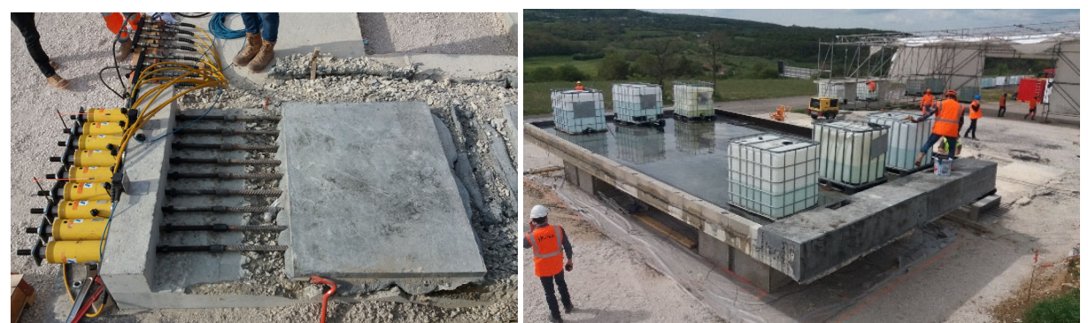
Figure 3: Test of rebars anchoring in UHPC Figure 4: Mockup ponding for waterproofing efficiency testing

Formal conformity to NF P18-470 with respect to durability was hardly verified due to difficulties in measuring the chloride migration coefficient of UHPC with a high steel fiber content; namely, the electric potential difference imposed to accelerate chloride migration induces an electric current which is not representative of the actual material behavior in case the fiber content is high enough to significantly increase the material conductivity. As an interim measure, it has been decided to characterize and control the migration coefficient of the mix without fibers.