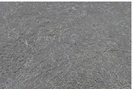
Figure 7b: UHPC made with same constituents Fluid consistence (+ 2 kg/m<sup>3</sup> SP dosage) Surface aspect. Random fiber orientation