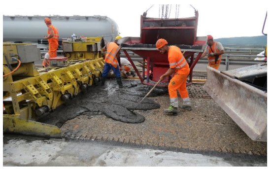
Figure 6: Preliminary UHPC placement before thickness equalization by the finisher