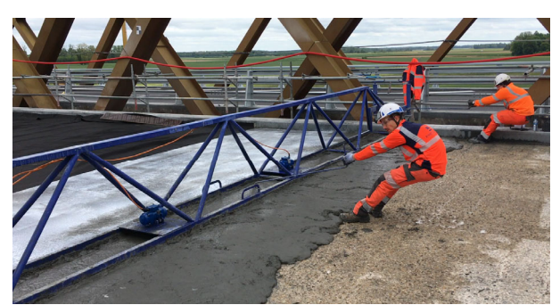
Figure 5: UHPC overlay extrusion with hand-drawn vibrating screed