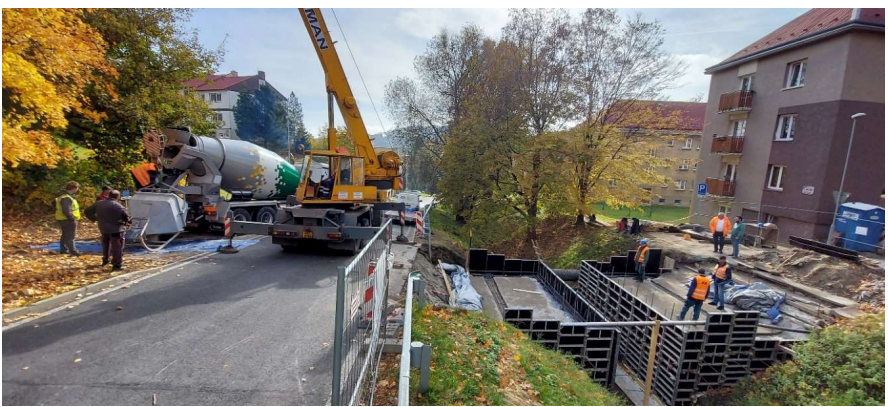
Fig. 1 UHPC casting