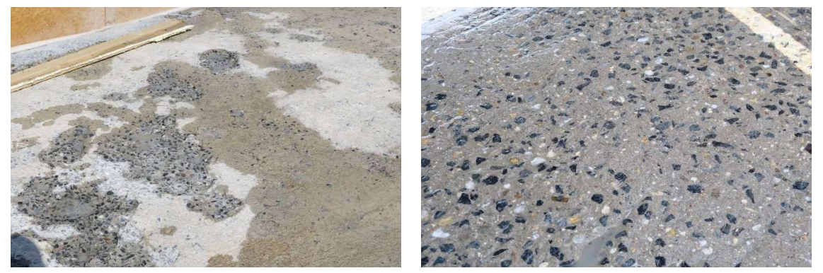
Fig. 4 Concrete surface above cantilever

A very important part of this technology is preparation of the substrate surface. In this case there were two types of surfaces. On the side cantilevers, the original concrete surface was exposed following water insulation removal. The quality of the concrete surface was very variable in this part. Some parts of the surface were not possible to treat, even by high pressure water jet blasting and in other parts, water jet blasting made large disruptions of the surface (fig. 4). In the area of traffic lanes, the surface of the original concrete was milled. The surface after milling appeared to be good, but roughness was not sufficient. Aggregate of the old concrete was milled as well (fig. 5), which is not good for bond of a new UHPC layer.