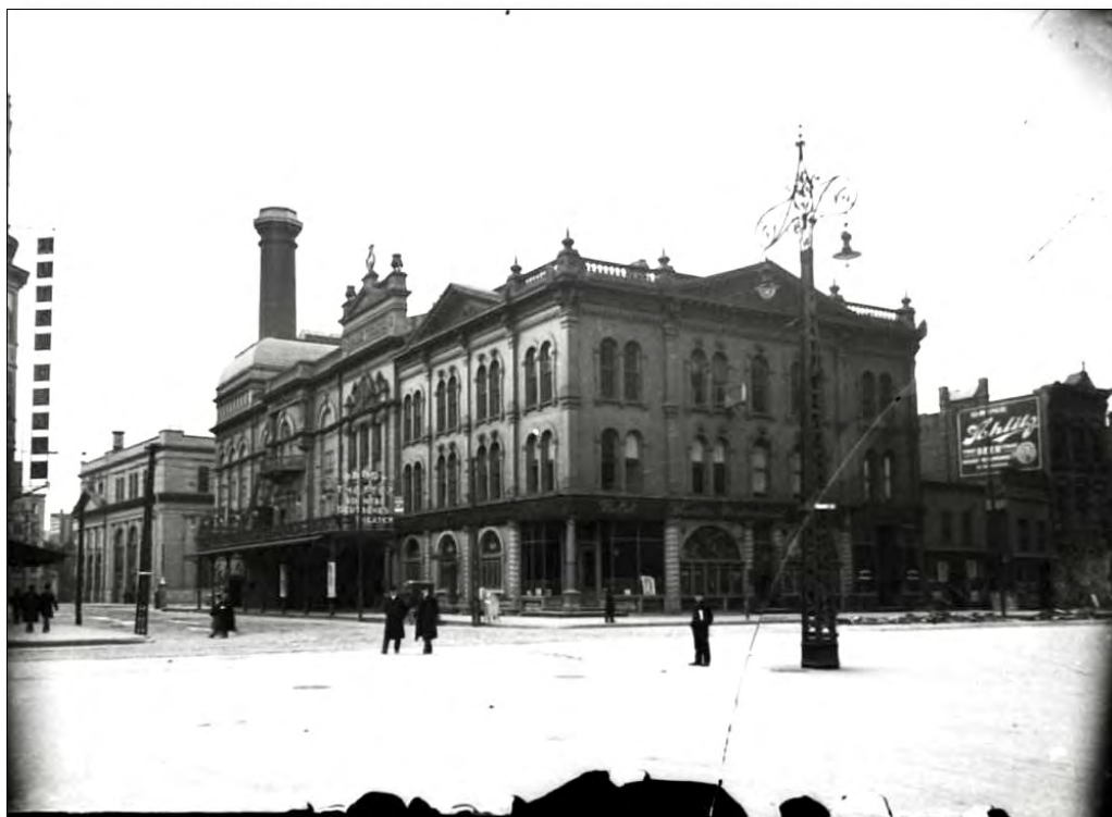
A photograph of the Pabst Theater created from a glass negative from the Heath collection, c. 1890–1910.