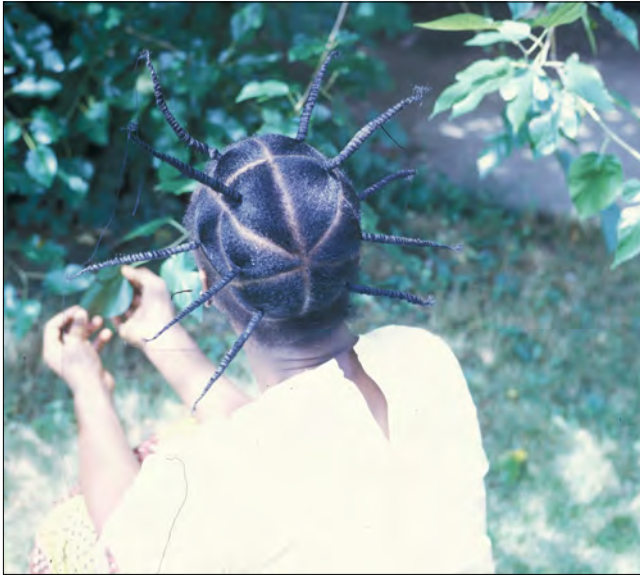
Woman with threaded hair, Techiman District, Ghana.

woman's hair, wrapped in thread and pointed straight up. The image was titled "woman with plaited hair."