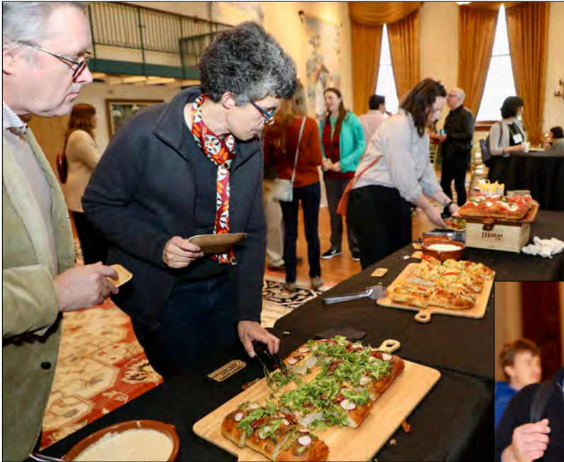
The appraisal process is an important first step.