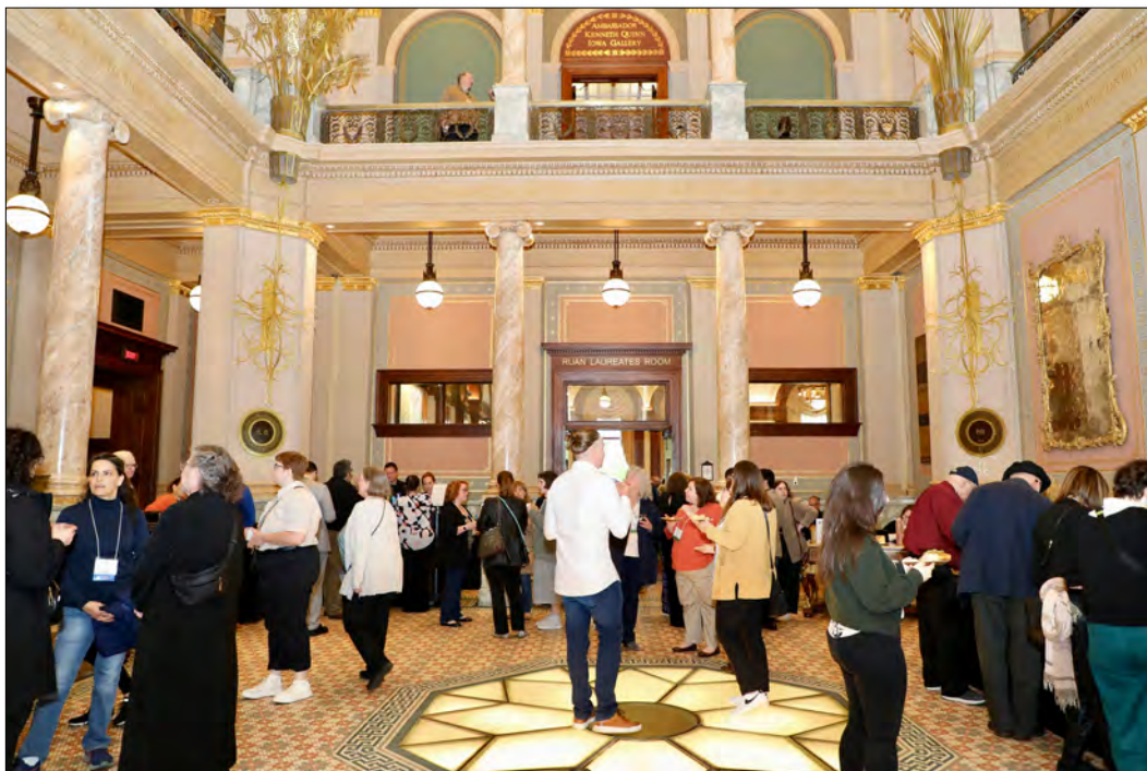
Annual Meeting reception at the World Food Prize Hall of Laureates

Early May is a great time to visit Des Moines, and we had perfect weather on Friday evening for restaurant tours and fireworks at the Iowa Cubs baseball game. We hope everyone enjoyed the opportunity to connect with colleagues!