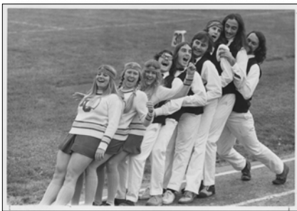
Principia College Cheerleaders, circa 1973.

In April 2024, the Principia Archives launched a new exhibit, Athletics for Everyone at Principia . The Archives and Collections objects on display date from as early as 1903 and celebrate over 120 years of student athletic participation at Principia. Principia founder Mary Kimball Morgan promoted character development through the “education of the whole man—physically, mentally, socially, and spiritually, as well as intellectually.” Principia continues to embrace the “whole person” physical education approach, providing opportunities for all students to participate no matter their skill level. The exhibit is on display at Principia College, Marshall Brooks Library, Elsay, Illinois, through October 2024. Visit the beautiful historic landmark campus and enjoy this exhibit or visit the abbreviated digital exhibit at https://library.principiacollege.edu/Archives/Exhibits .