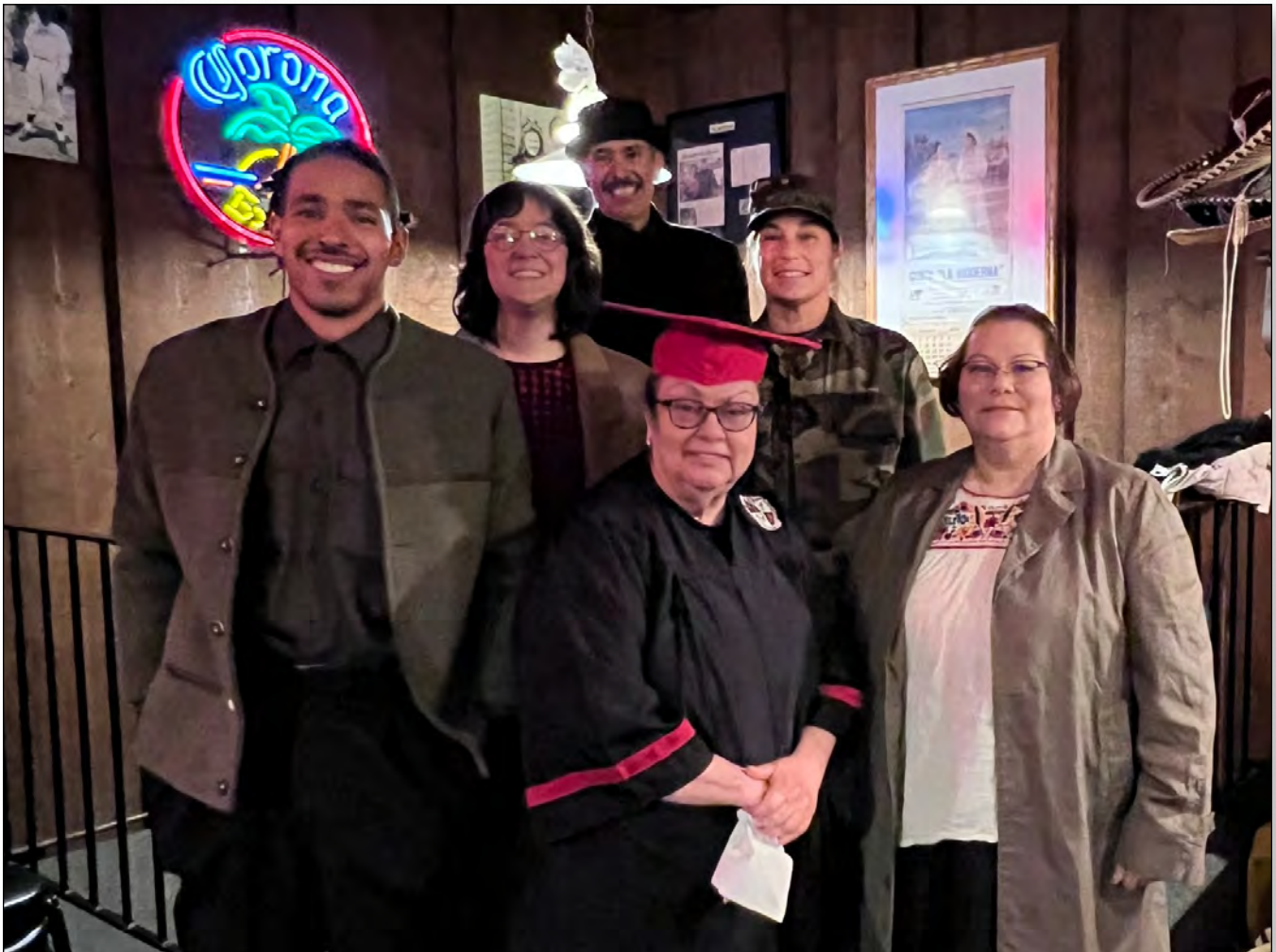
Actors from the Ghost of Galesburg 2023 event.

In addition to the thematic exploration, the event was synchronized with the placement of historical plaques at the boxcar camps. These plaques include the names of families who lived at the camps, recognizing their commitment and work. This initiative by the local community college helped physically embed the narrative into the community.