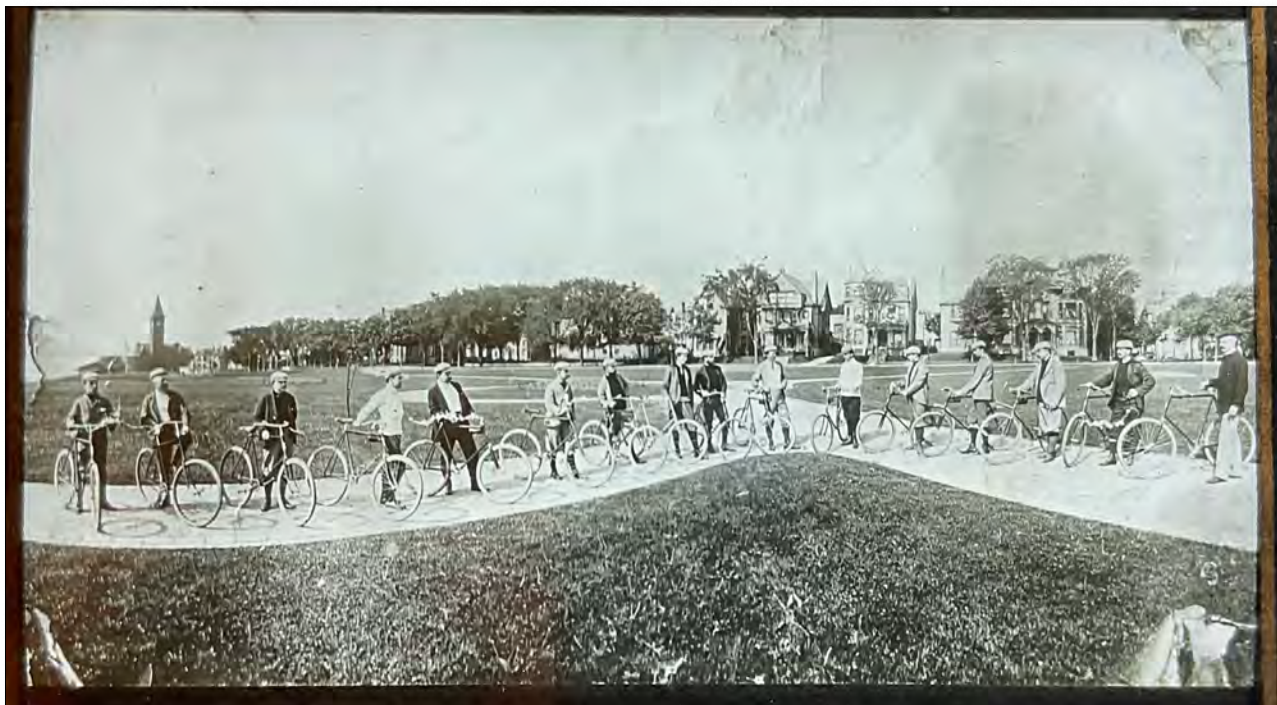
Glass slide from the Milwaukee Wheelmen collection of the Milwaukee Wheelmen on a Sunday outing at Juneau Park, c. 1890–1910