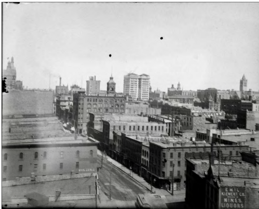
A photograph created from a glass negative from the Addicks collection. This photograph was taken from the roof of the Goll & Frank building looking north, c. 1890–1910.