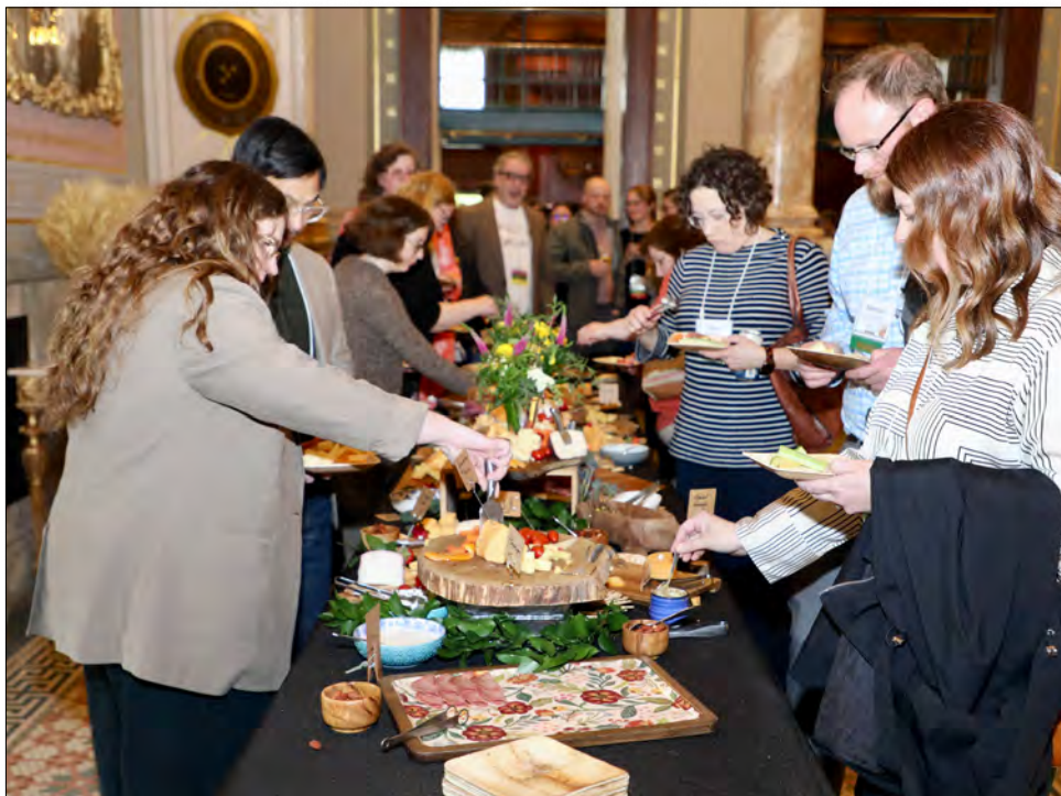
This may have been the cheesiest reception in MAC history.