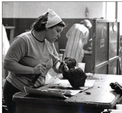
Art class at the Nelson-Atkins Museum of Art, early 1970s.

digital resource documenting the stories and careers of various Missouri visual artists who have helped shape the artistic heritage of the state. Researchers from the Nelson-Atkins Museum of Art, the Kansas City Art Institute, and the St. Louis Public Library worked collaboratively to add over 280 artists to the still-growing portal with entries based on research from artist files, library resources, local historian files, and archival materials. The project aims to aid users in the discovery of Missouri's rich artistic legacy and to shine a light on those artists who may have been looked over in the past. It was endorsed as part of Missouri's Bicentennial Commission in 2018, Missouri Remembers can be accessed at https://missouriartists.org .