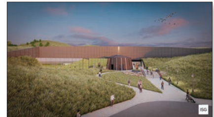
CHC Rendering Credit: ISG Architects

The Cultural Heritage Center, which houses the South Dakota State Historical Society in Pierre, is undergoing renovation now through 2025, just in time for the nation’s 250th anniversary. The renovation project will enhance storage for artifacts and archives, update staff areas, and reimagine the gallery spaces. The work should give the society another 20 years in the building. Recently, the renovation project moved from its conceptual phase to design development where costs are being calculated for updates. Collections will be stored off-site, but the Cultural Heritage Center will remain open and operational during the renovation. Next will be the conceptual phase for the revised exhibits with renovation getting under way early next year.