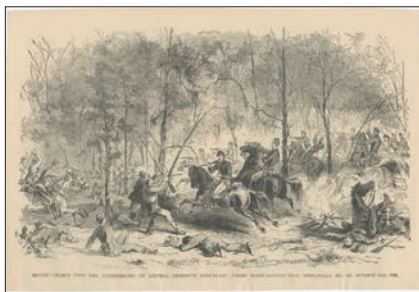
Sample from the Civil War in Missouri collection.

The Missouri State Archives is pleased to announce the creation of a new collection on Missouri Digital Heritage. Civil War in Missouri features 221 items totaling 618 pages gathered from a dozen smaller collections, all nongovernmental records on the Civil War in Missouri. Letters provide insight into what families were going through during this conflict. The correspondence can be poignant, informative, disturbing, or all of the above. The collection also includes over 50 illustrations from contemporary newspapers such as Harper's Weekly . Photographs include portraits of soldiers, officers, and civilians. Every letter (except for one in German) is fully transcribed so that keyword searching is enabled and young researchers who may not be adept in reading handwriting of the era can appreciate the content and consider using the letters for upcoming National History Day projects. Visit https://mdh.contentdm.oclc.org/digital/collection/p16795coll39 .