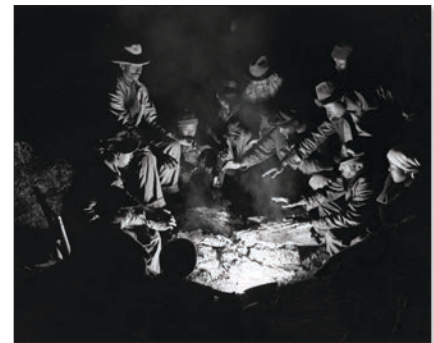
A group of evicted sharecroppers sits around a fire along Highway 61 in southeast Missouri, 1939.