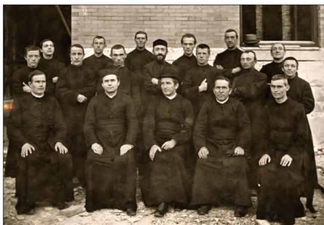
The first SVDs during construction of their community in Techny, IL, 1900

The SVD community was also quite pleased with the exhibit, though for some, the idea of a completely virtual exhibit was confusing. “What’s a digital exhibit?” was a question we heard many times during the exhibit’s development. Many of my colleagues working in academic archives benefit from students and faculty who are comfortable with a wide array of digital tools and platforms (or at least the concepts behind them), but religious archivists often find that our older community members are not nearly as well versed. For them, viewing an exhibit means an in-person encounter with physical materials.