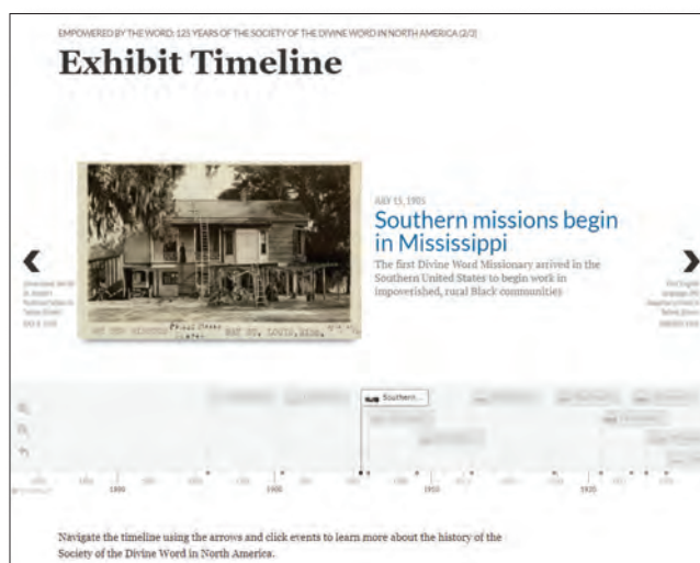
A portion of the centerpiece timeline of Empowered by the Word

An anniversary is a celebration of time, so it made sense to make Scalar's interactive timeline tool the centerpiece of the exhibit. I find Scalar's timeline to be both striking in its design and intuitive to use. However, as exhibit design progressed, it became clear that the points on our 125-year timeline (which link to exhibit pages discussing the respective events) needed to be at least three years apart to maintain real visual impact. Unfortunately, historical events tend to happen in fits and starts rather than at a uniform rate.