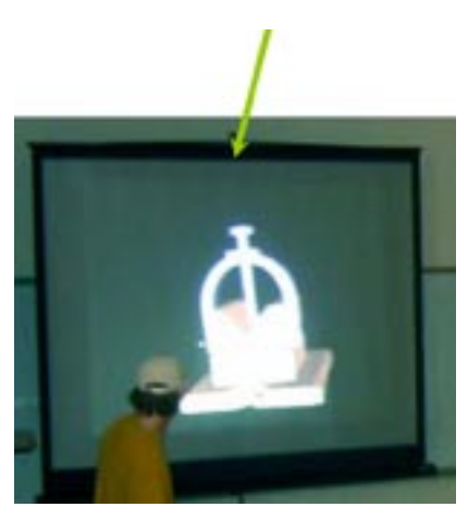
(b) A polarized VR model