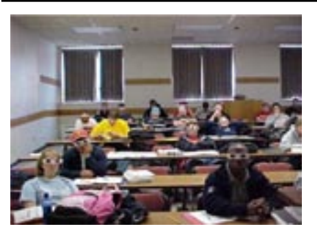
(a) Anaglyphic system Figure 3. Students experiencing VR instruction