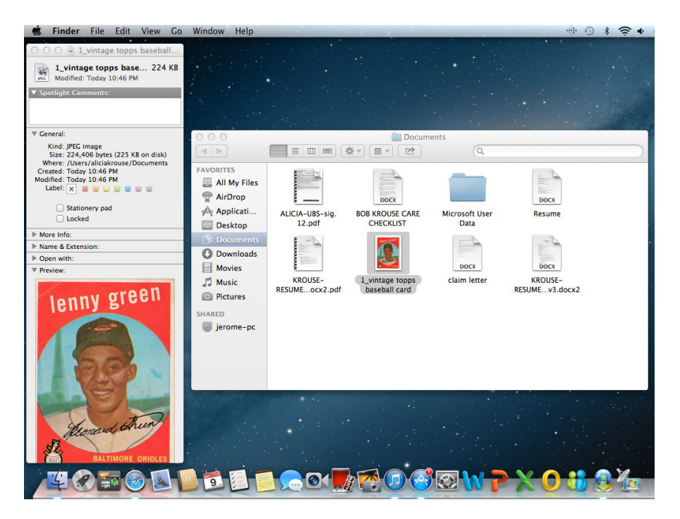
Figure 3. Metadata entry within details section of file properties (Mac)