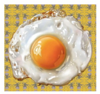
Figure 2. Egg motif

The shape of each pattern piece was emphasized by digitally engineering a single large-scale fried egg image. The image was obtained by a web search for a high-resolution image of a fried egg, which was free to use. Resources, such as Adobe stock, provide high-resolution images available for purchase. The png image of the fried egg was opened in Photoshop; there was no need to remove the background because the png file already had a transparent background before it was downloaded. Since this prototype is part of a series, the first step was to check the coloration of the image with the coordinating color story and fabrics. A new layer was added to the file and filled with one of the coordinating digital textile surface designs (Figure 2). This layer made it easy to compare the colors while the adjustments were made using the hue/saturation toggles. The coordinated print layer was deleted after the adjustments were made. The fried image was placed and scaled so that the image was the close to the pattern piece shape so it could be finished using the live edge technique. The image was strategically warped with digital tools so that the fried egg edge lined up as close to the pattern piece edge as possible.