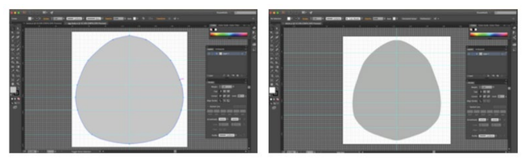
Figure 1. digital drawing of geometric shapes in Illustrator

Only two unique egg-shaped pattern pieces were needed for the shirt. Figure 1 represents the bodice and the sleeves.