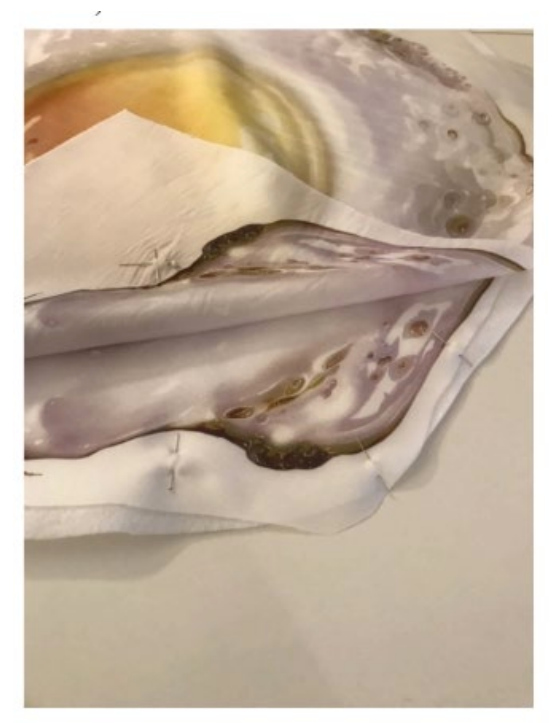
Figure 5. Live edge line up

After the arrangement was set, layers were merged, flattened, and saved as a different file. The file was then saved in the format required by the DTP university lab. The DTD was printed on silk habotai, processed, and shipped. The researcher/designer flat lined each garment piece along the live edge of the egg. The slashes on bodice front were faced, and then the front and back were stitched together. It was critical that the live edges mirrored perfectly and this was hard to do with both pieces backed with the felt. Therefore, the backing was temporarily removed from the bodice back so the front and back imagery could be lined up (Figure 5). The printed fabric was sheer enough that it was easy to line up the edges properly and hand basted exactly along the live edge outline. The first iteration of the origami shirt had the sleeves as a detachable feature. The sleeves attach to the shift dress with snaps and fit through the sleeve opening of the jacket. The slashes on the jacket work on the body to form the silhouette. Figure 6-10 show the finished artifact during its transformation and as stages. The following link is to the video transformation for the first iteration of origami transformation and fried transformation will be presented in the same fashion: https://www.youtube.com/watch?y=0EnloLGdkrg