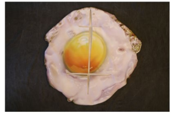
Figure 6. Step 1 fried transformation