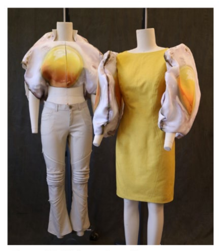
Figure 10. fried transformation