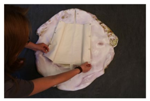
Figure 8. Step 3 fried transformation