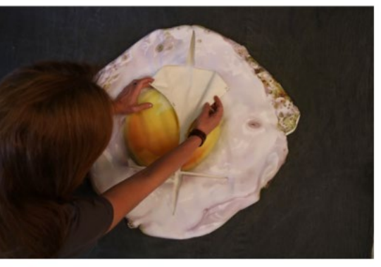
Figure 7. Step 2 fried transformation