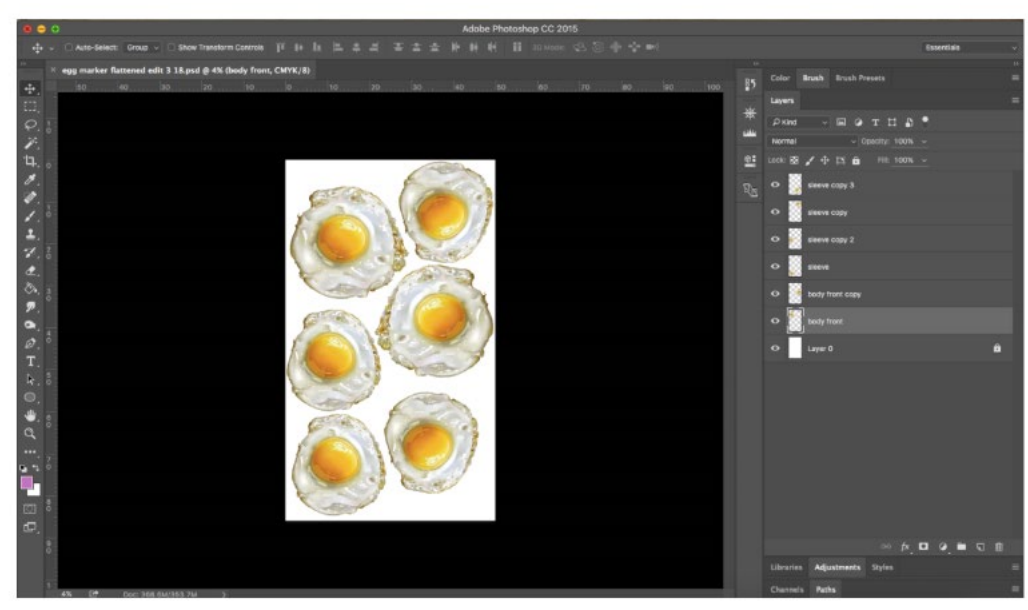
Figure 4. EP B3 #14 DTP engineered marker

Once the fried egg image was manipulated to the bodice and the sleeve pattern pieces, they were digitally placed into the Photoshop marker. The bodice layer was copied once and flipped horizontally so the front and back were mirrored. The sleeve layer was duplicated three more times and two of those layers were flipped horizontally. While all of the pieces were still on their separate layers, the pieces were moved to create a marker with as little waste as possible, keeping in mind the space required for seam allowance (Figure 4).