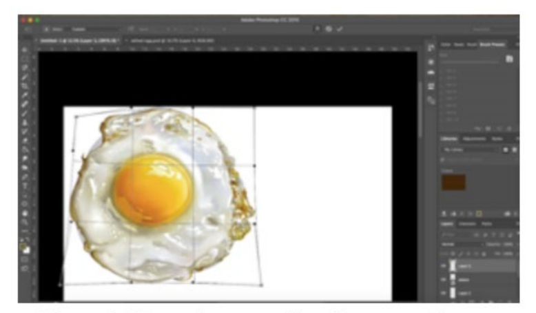
Figure 3. Warped egg motif to fit pattern shapes

Once the fried egg image was manipulated to the bodice and the sleeve pattern pieces, they were digitally placed into the Photoshop marker. The bodice layer was copied once and flipped horizontally so the front and back were mirrored. The sleeve layer was duplicated three more times and two of those layers were flipped horizontally. While all of the pieces were still on their separate layers, the pieces were moved to create a marker with as little waste as possible, keeping in mind the space required for seam allowance (Figure 4).