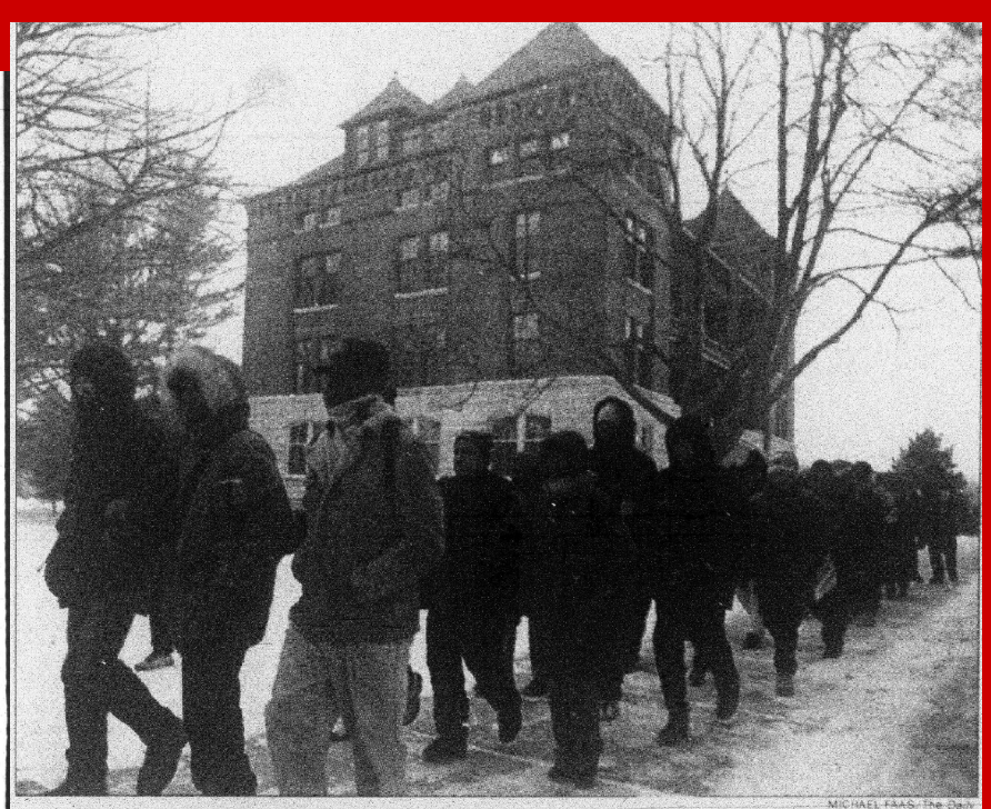
More than 100 students and faculty participated in a silent march from Parks Library to Carrie Chapman Catt Hall in protest of the building's name.

"... Our signatures demonstrate our extreme discomfort at this harsh sanction against mature, heartfelt expression of ideas on this campus. This petition is intended to show our support for these students independent of our positions on the question of renaming Catt Hall."