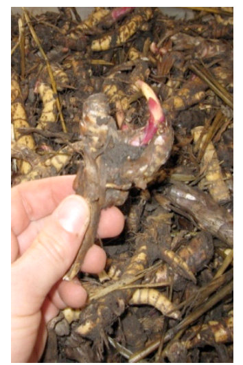
Figure 2. Field dug rhizomes of M. x giganteus.