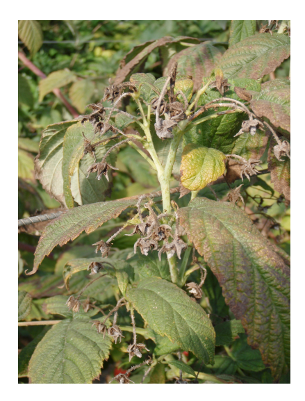
Figure 4. Botrytis fruit rot on Autumn Bliss raspberry blossoms and developing fruit.