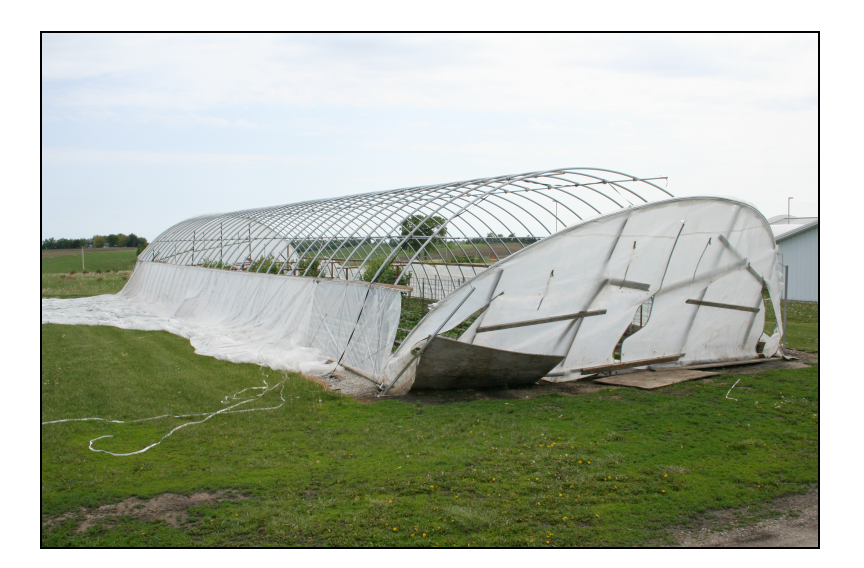
Figure 3. Wind damage to the high tunnel at the Armstrong Research Farm on May 25, 2008.

Figure 2. Weekly average berry weight of Tulameen and Autumn Bliss raspberries, and Ouachita blackberry grown in a high tunnel at the Armstrong Research Farm (ARF) and Horticulture Research Station (HRS) in 2008.