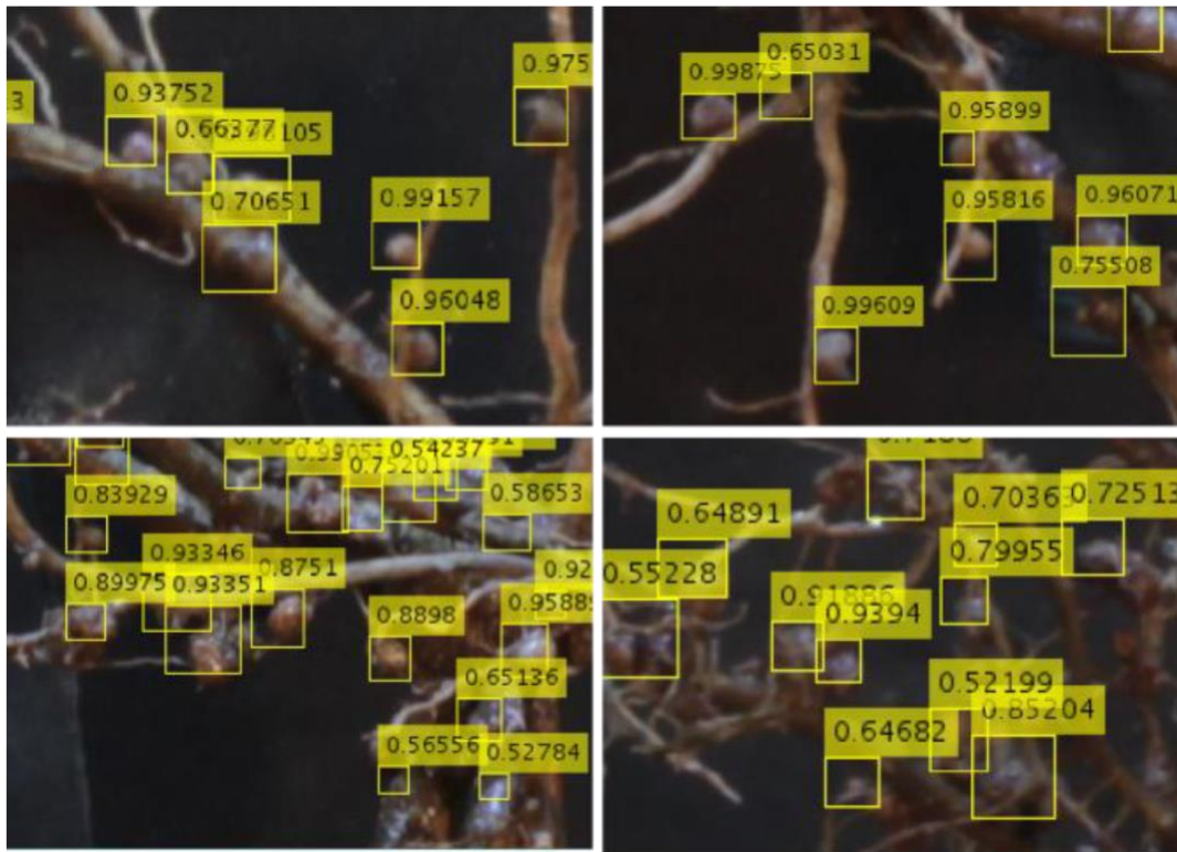
Figure 1. Nodules classified by SNAP.

In this figure, bounding boxes and their respective class scores show the confidence of the box containing a nodule on soybean roots.