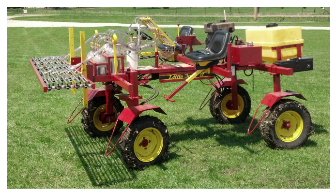
Figure 2. Self-propelled research sprayer built by Iowa State personnel.