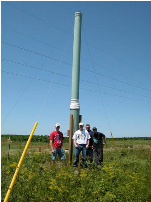
Figure 1. One of four suction traps set up in 2005 for soybean aphid sampling.