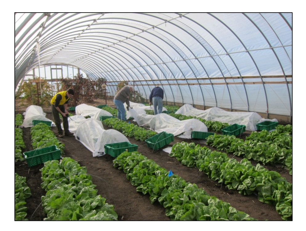
Figure 1. Lettuce harvest under progress at the ISU Armstrong Research Farm on November 8, 2012.