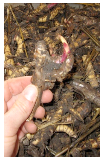
Figure 2. Field dug rhizomes of M. \times giganteus .