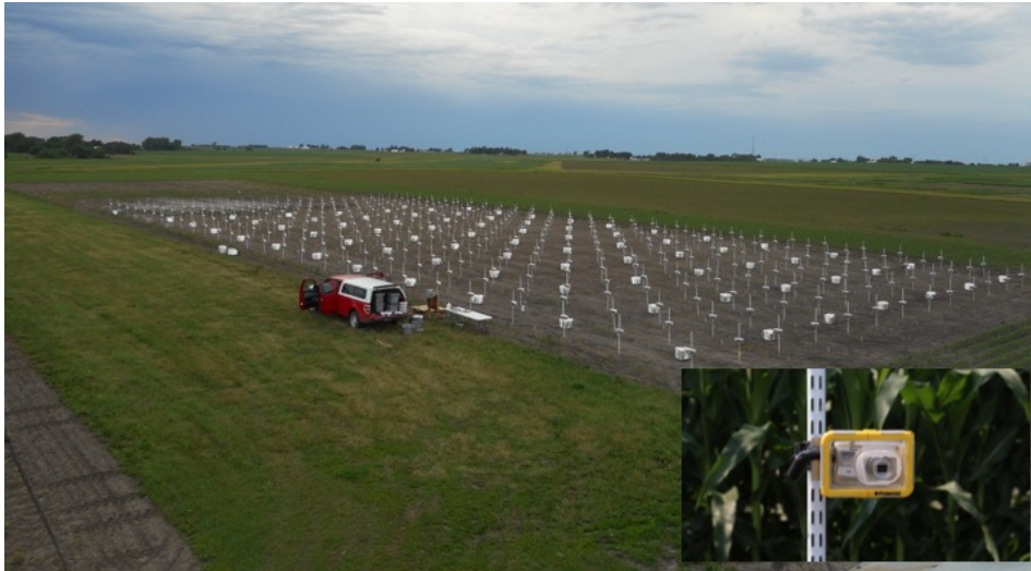
Figure 1. Camera system in Ag Engineering/Agronomy Farm field in 2018. Throughout the growing season, 380 cameras were deployed in the field.