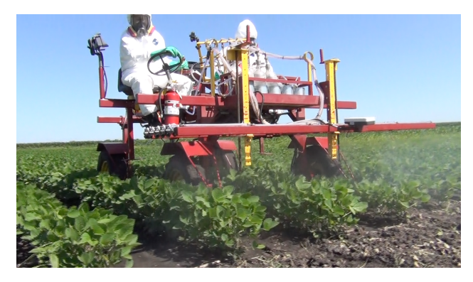
Figure 2. Self-propelled research sprayer applying treatments in Ames, IA.