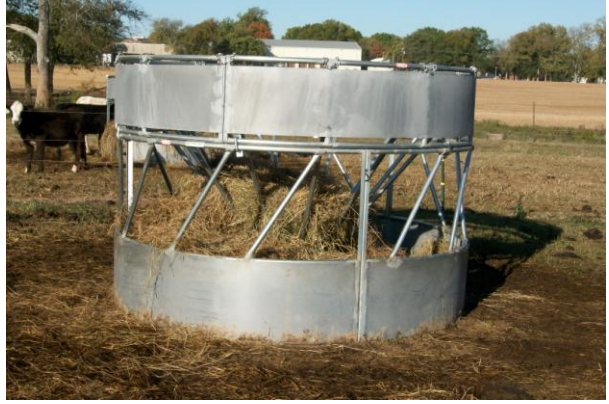
Figure 1. Each pen included one cone-style hay feeder to feed hay or haylage.

Nutrient analysis of the forage : Forage samples were randomly collected (n = 10 bales / treatment). Samples were collected using a hay corer (40.6 cm long x 2.5 cm long) and mixed together for testing. Samples were stored in a plastic Ziploc freezer bag, frozen, and shipped to a commercial laboratory for a nutrient analysis (Table 1).