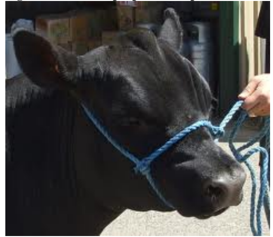
Figure 1. Calf with proper halter placement.

On the test day, steers were moved by the Beef Farm crew from the home pen to a separate pen that measured 5 m