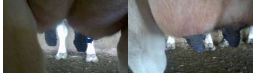
Cow NTB T-Hexx Left side