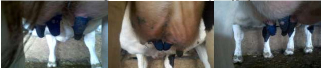
Cow 7894 T-Hexx right side