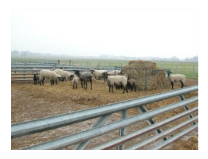
A group of lactating ewes and lambs in early spring.