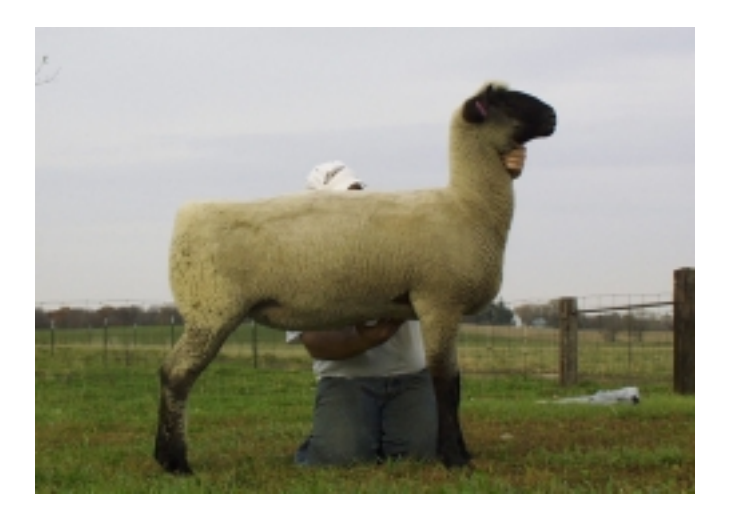
A top quality Hampshire ewe lamb from the 2001 lamb crop. This ewe lamb was 3<sup>rd</sup> in class at the Iowa State Fair and 6<sup>th</sup> in class at the North American International Livestock Exposition.