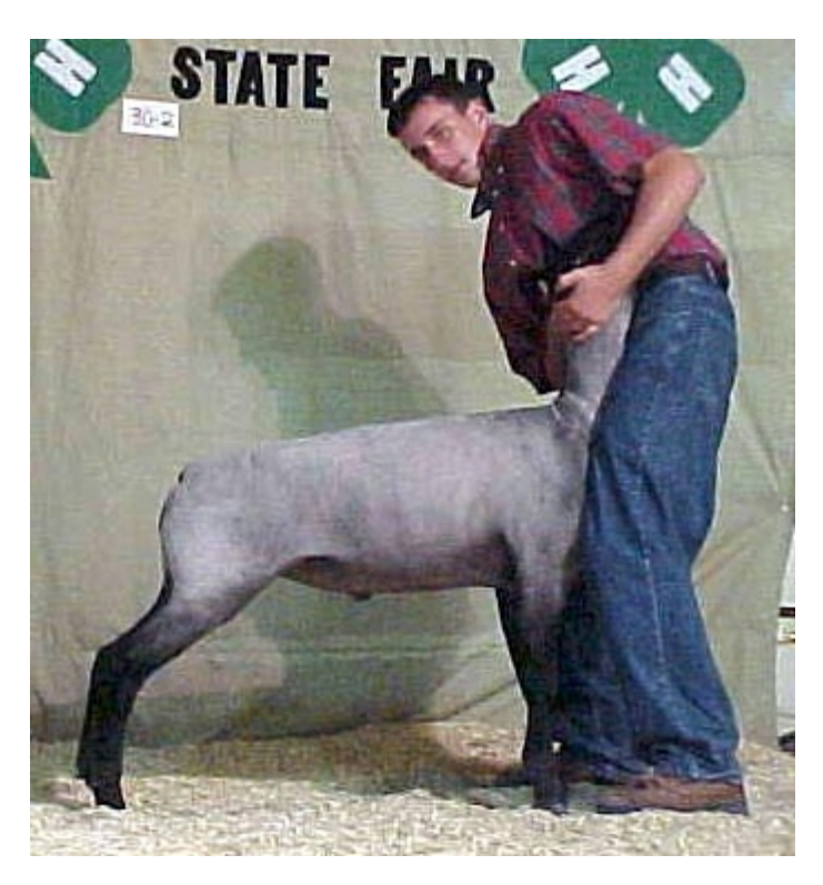
5^{th} place overall 4-H market lamb at the 2001 Minnesota State Fair. Raised by the ISU Sheep Teaching Farm