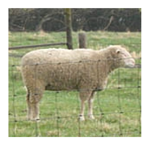
A stud ram from the commercial white face flock.

The third and final management system utilizes a flock of 70 Suffolk-based commercial ewes that lamb in January and February. The objectives of this management system are to produce competitive show lambs for sale to junior livestock exhibitors for county, state and national exhibition. Select stud ram prospects and replacement ewe lambs are marketed directly from the farm or at state and national sales.