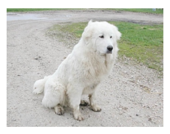
Hank, the Great Pyrenees guard dog at the farm, is used to protect the flock against coyote predation.

The farm and its livestock are also used for a variety of events for the Block and Bridle club including Little North American Showmanship Competition, Junior Livestock Evaluation Competition, VEISHEA petting zoo, and Ag Olympics. Block and Bridle club members also organize and schedule tours of the farm for day-care and pre-schools units in the Ames area.