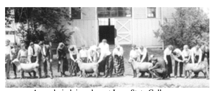
An early judging class at Iowa State College

The Iowa State University Sheep Teaching Farm is one that is steeped in tradition and excellence. Iowa State University has been exhibiting sheep at the highest levels of competition since the very beginning of livestock shows in the United States. Iowa State College's interest in sheep exhibiting began in the early 1900's when the college exhibited Oxford and Southdown wethers at the 1912 International Livestock Exposition in Chicago, II. The farm continues to raise productive, competitive breeding stock today.