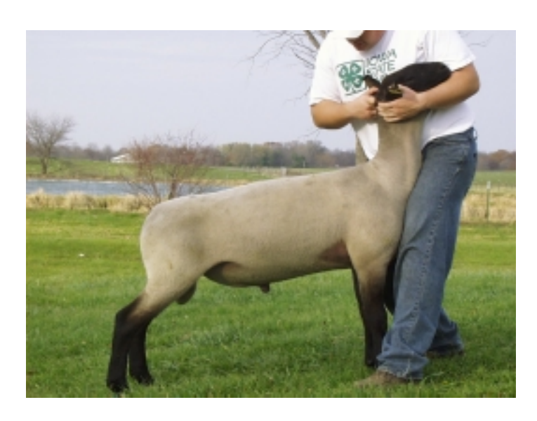
McIlrath 0150 – one of the outstanding sires in the Suffolk breeding program.