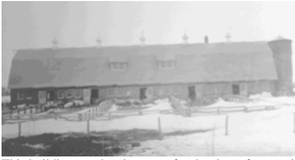
This building was headquarters for the sheep farm until 1965 when the farm was relocated to its current site on South State Street Avenue.