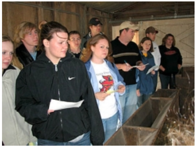
Animal Science 114 lab students taking a tour of the ISU Sheep Teaching Unit