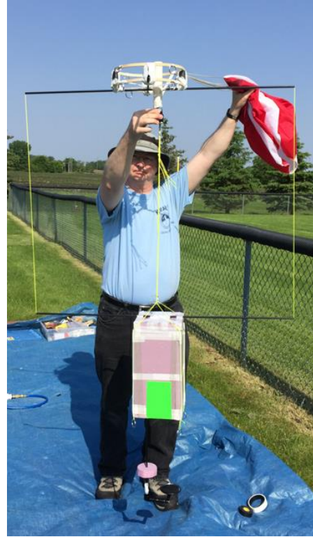
Fig. 5. Preparing a 1-D anti-rotation boom for use with a single-payload, 300-gram balloon flight. The parachute will lay in the parachute basket, made from two embroidery hoops (AKA spreader rings). The pvc tube around which the parachute basket is built, will be partially inserted into the balloon neck. The central line holds the load – 2 outer lines prevent relative rotation.