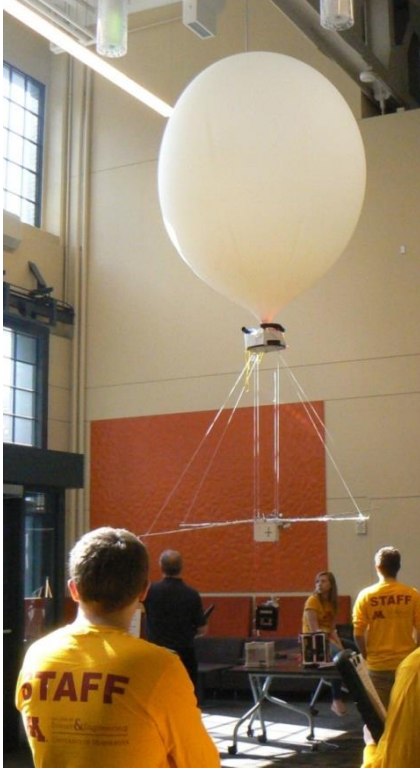
Fig. 4. A 1600-gram balloon is inflated indoors for an exhibit. Notice the parachute basket and the 8 widely-space load lines extending down to the (white) payload below and to the ends of the 3-m-long booms on the lid of the payload below. The “Goldy Gophernaut” video footage (see YouTube link in main text) came from the black box suspended below the white payload.