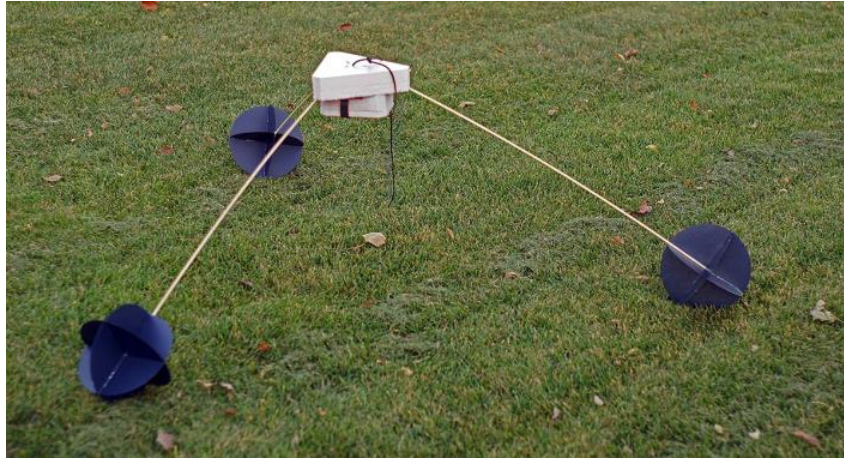
Fig. 2. Photo of Rick Brennan's built device which was flown, attached by a single line, at the bottom of a payload stack. The central part of the structure contained a video camera. Good stabilization was achieved, but only this bottom payload was stabilized.