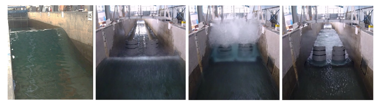
Figure 4. Smart Walls Subjected to Tsunami Scenario