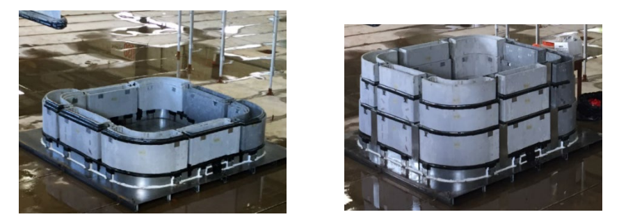
Figure 2. Smart Walls Enclosure. a) Retracted, b) Extended