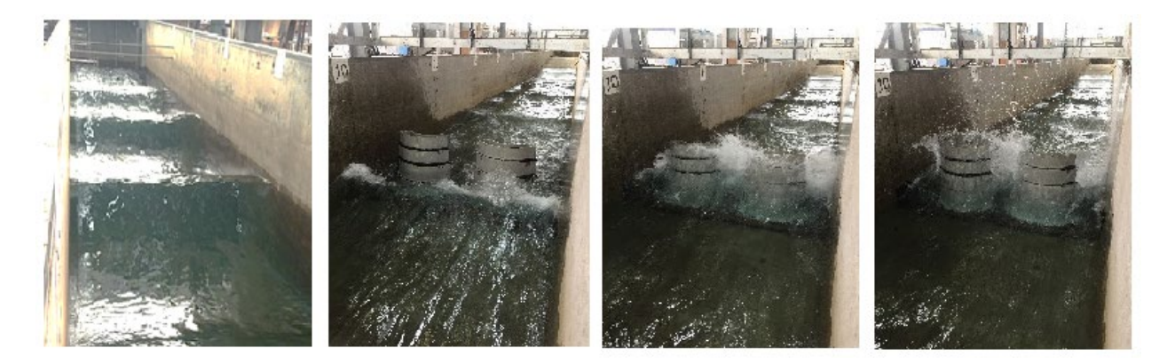
Figure 3. Smart Walls Subjected to Storm-Surge Scenario