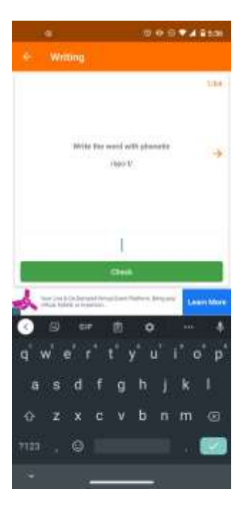
Figure 5 Writing Activity