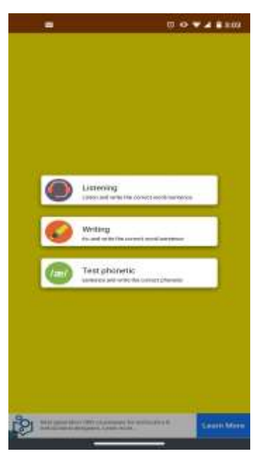
Figure 3 More Features in Basic section