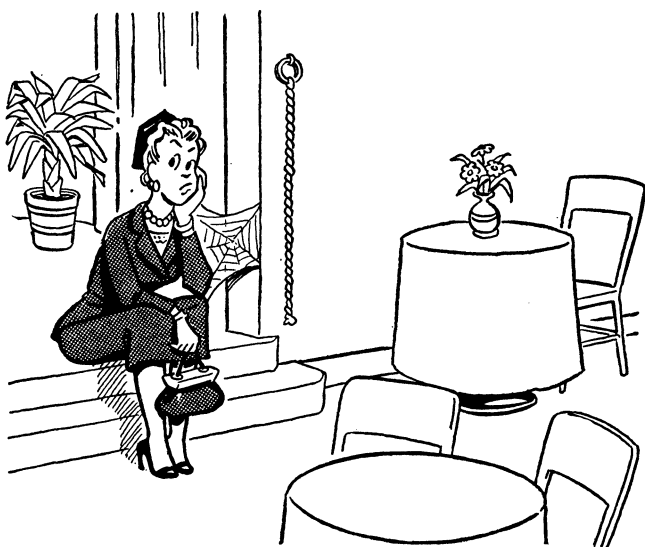
Wait at the door for the head waiter to seat you.

If you have a descriptive booklet of eating places, you can find out about these charges before you go. But do not be too timid to ask. You wouldn't buy a hat without knowing the cost. Why buy a meal without knowing you