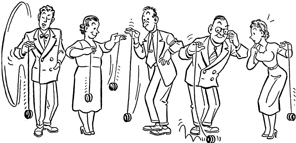
In a city, you'll find many kinds of classes . . .

Increase your circle of friends and acquaintances as you increase your interests. Your teammates at work may suggest that you join an office group, but don't restrict yourself to those with