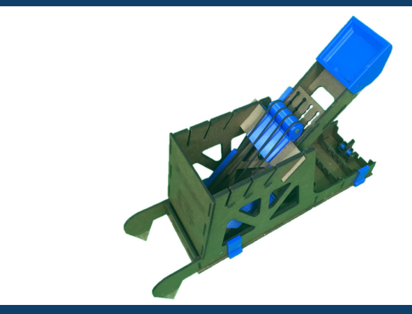
Figure 6: 2018 Tournament Entry

Figure 5: 2019 Tournament Entry (2nd Place)