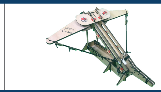
Figure 7: 2018 Tournament Entry (2nd Place)