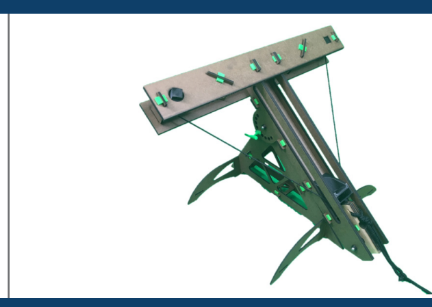
Figure 5: 2019 Tournament Entry (2nd Place)