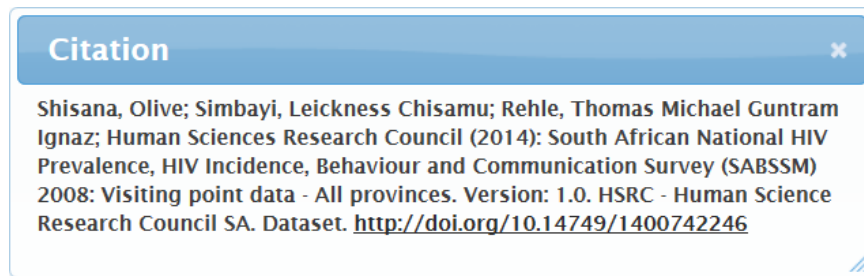
Figure 5. Example of da|ra recommended citation.

The citation style is complementary to the recommendations of DataCite (DataCite Metadata Working Group, 2014, p. 7; Starr & Gastl, 2011) as well as FORCE11 ( https://www.force11.org/node/4771 ).