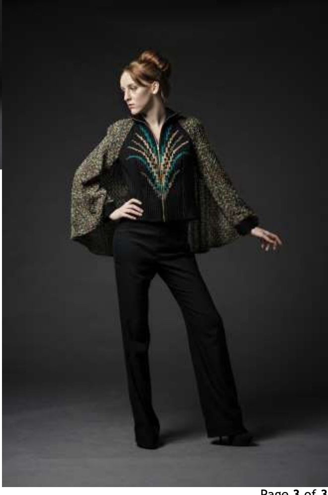
Page 3 of 3