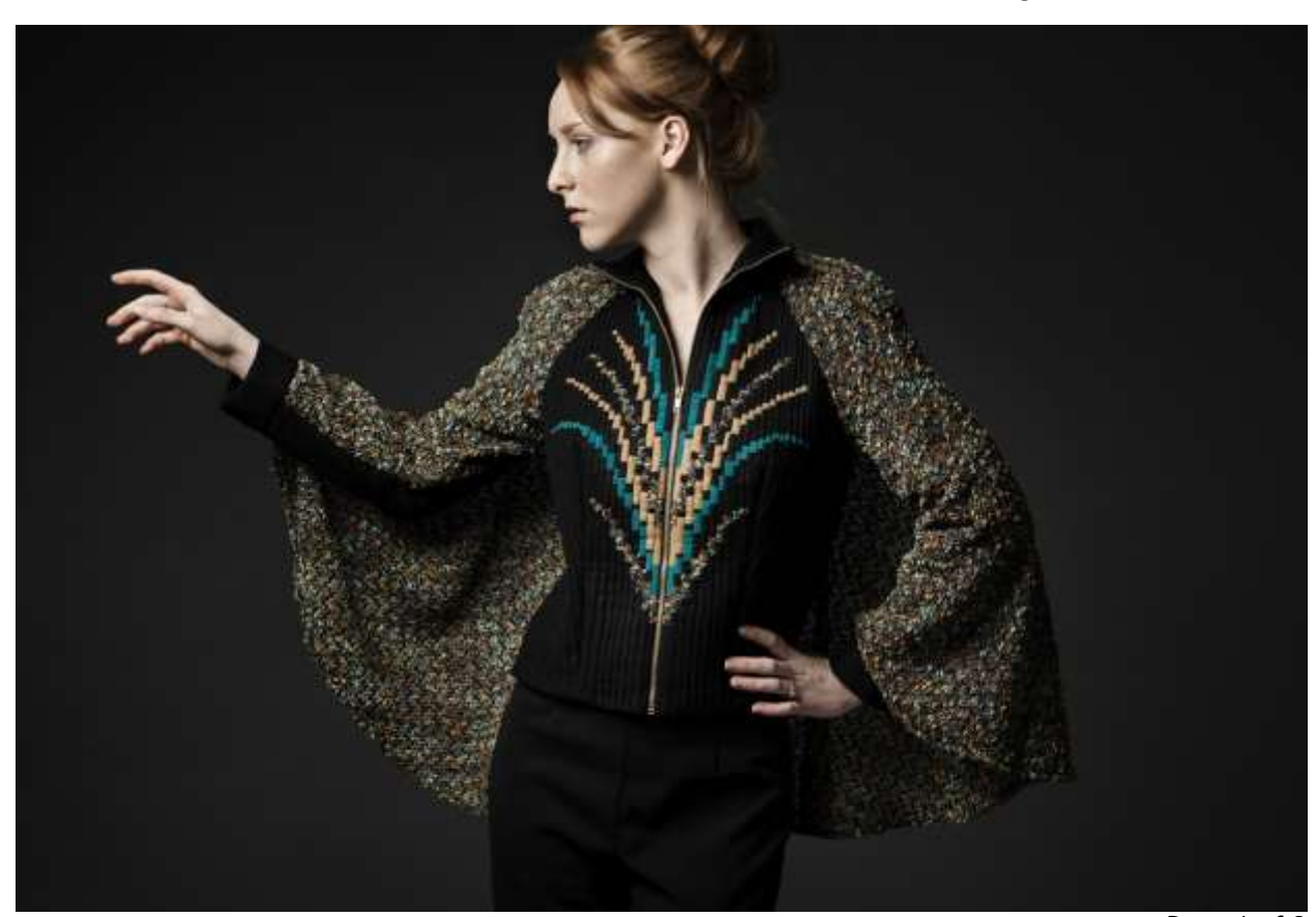
Page 1 of 3

To create front interest, leaf-like lines were hand drawn and colored. The drawing was transferred to