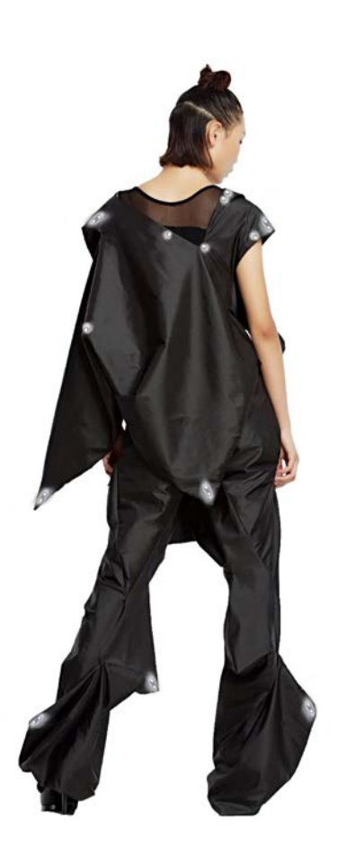
Figure 4: Back View