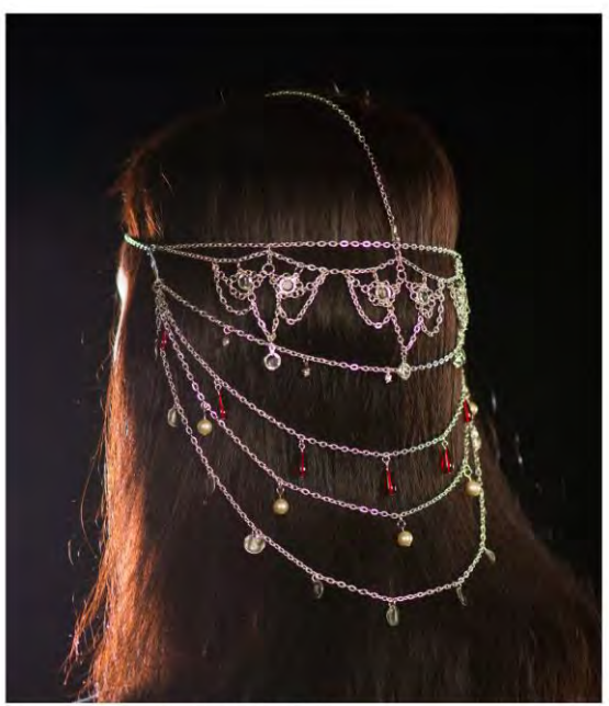
Figure 1. Back view of the Althea Goddess Headdress.

Cross-cultural design often asks for a successful merging of cultures to take place in the form of a product, but the findings of the present study found that Armenian heritage was predominantly indicated at the visceral level in the case of the AGH. The RPP assisted in the collection of these findings and, in so doing, takes into account the various components of culture (including heritage). Future research may include further testing of the Reflective Pyramid Process in the context of other cultures.