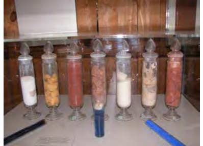
Figure 2. Examples of Dr. Carver's clay and minerals at Tuskegee Institute National Historic Site, photo courtesy of Curtis Gregory, Park Ranger, George Washington Carver National Monument

...clays are found in many sections of the country of a variety of colors, and by a proper choice of color there may be produced by the process of the invention a large variety of colors of pigments, fillers and stains for treating wood or other materials. (Carver, 1925, p.1)