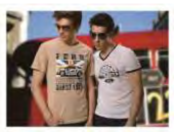
Figure 2. Examples of Ford fashion clothing extension