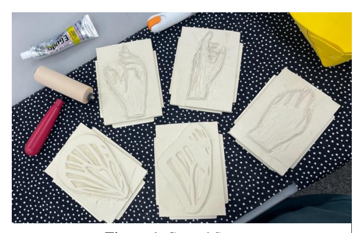
Figure 1. Carved Stamps

Mentor Statement. The purpose of this mentorship relationship was to assist Apparel Design and Manufacturing students in exploring global events/issues to develop interculturally competent citizens. A studio-based class of third- and fourth-year apparel design students were challenged to research a chosen global theme or problem and utilize the information found while designing a garment. The student designer in this study chose to focus their garment on immigration from Latin America. This design was chosen to be sponsored based on its high quality of construction and the significant meaning brought to the piece through imagery created using surface design techniques. This student successfully communicated their desired message to the viewer.