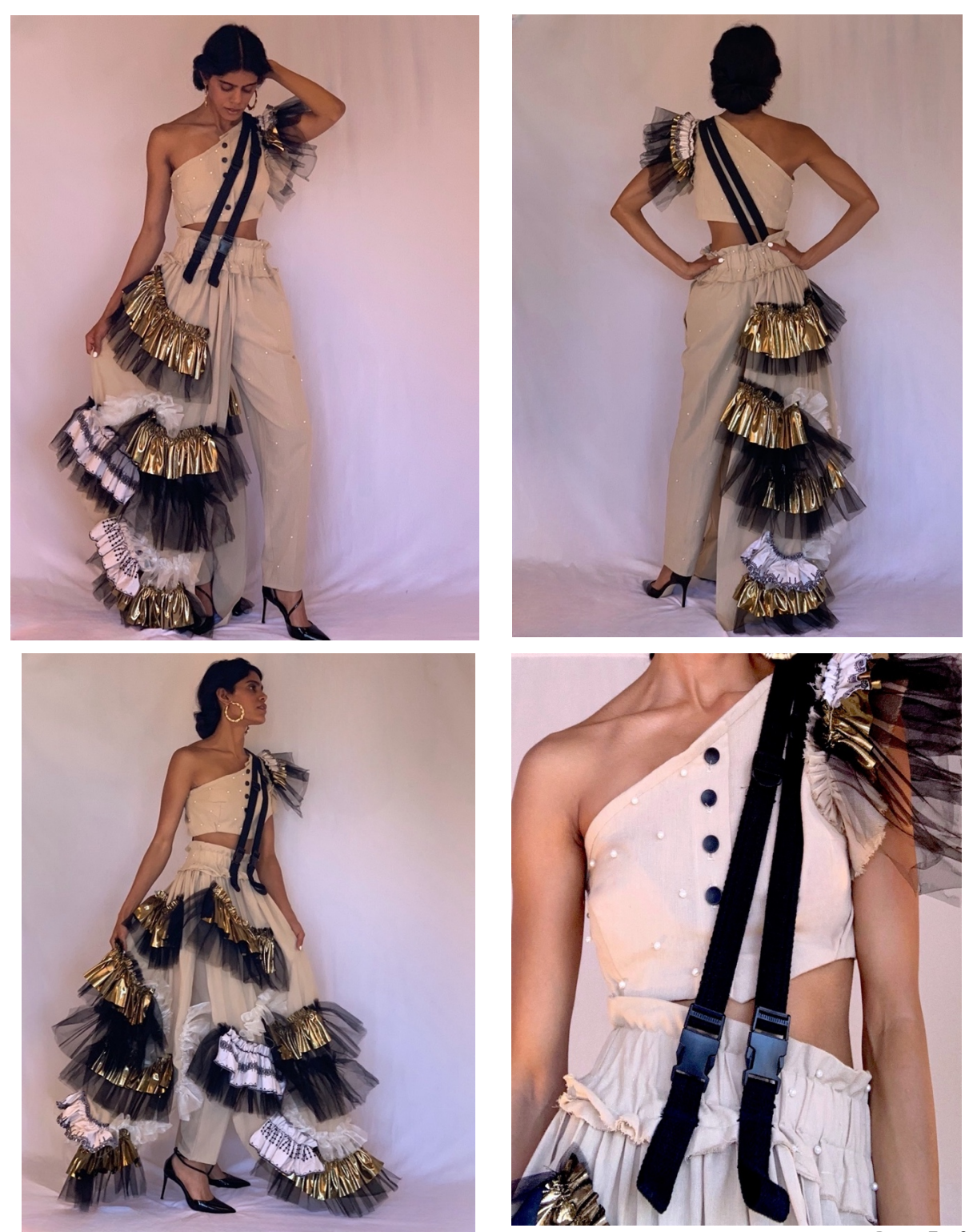
Page 5 of 5