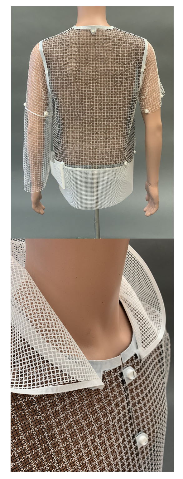
Page 5 of 5