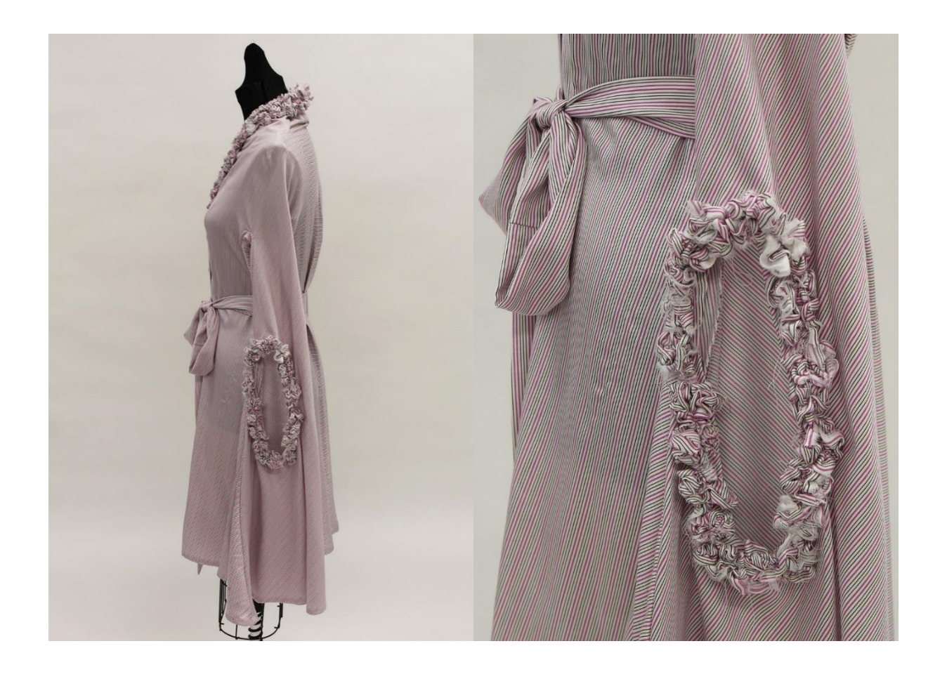
Page 5 of 5