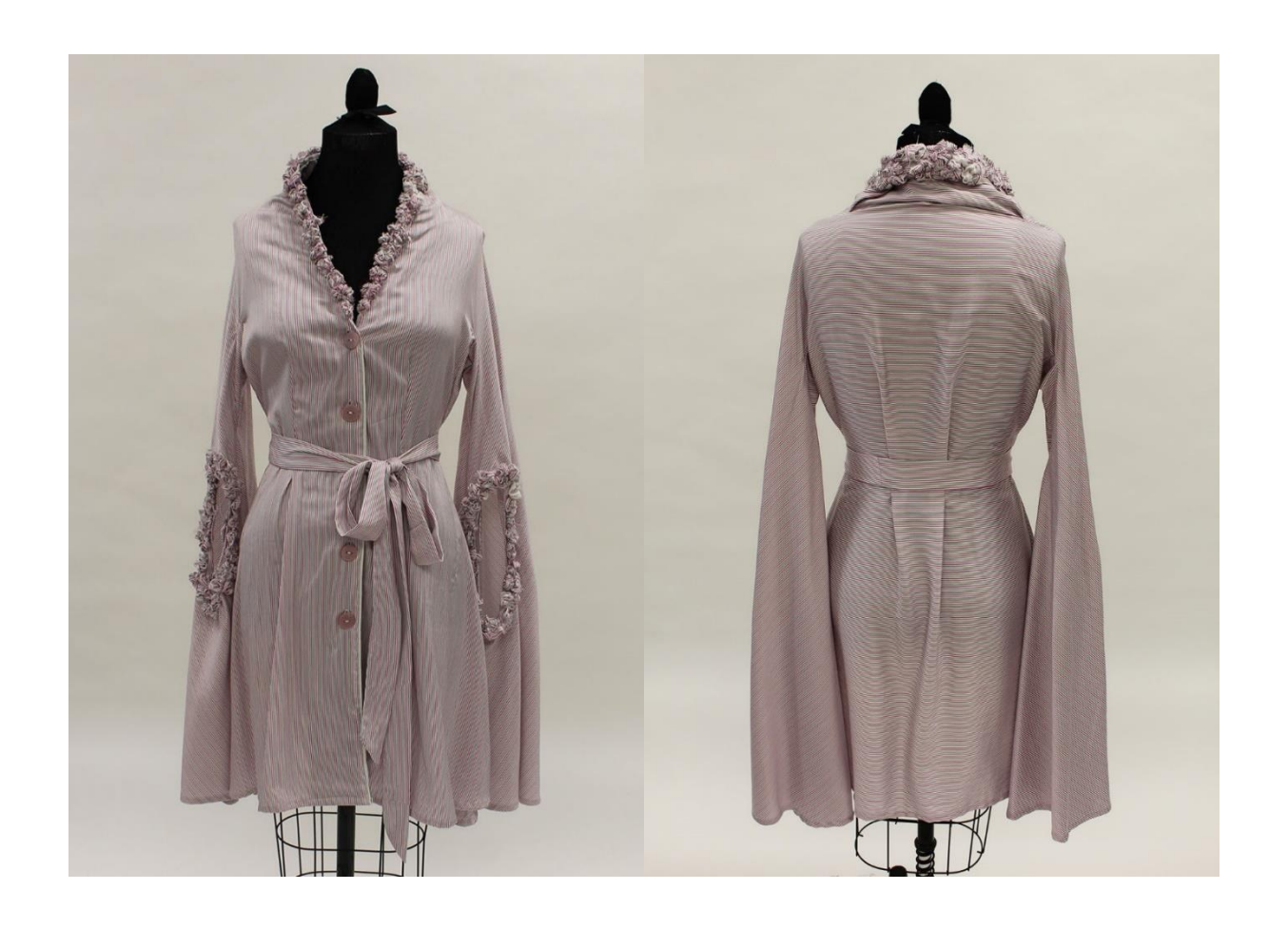
Page 4 of 5

Rauturier, S. (2022, February 21). Everything you need to know about waste in the fashion industry . Good On You. Retrieved May 13, 2022, from <a href="https://goodonyou.eco/waste-luxury-fashion/">https://goodonyou.eco/waste-luxury-fashion/</a>