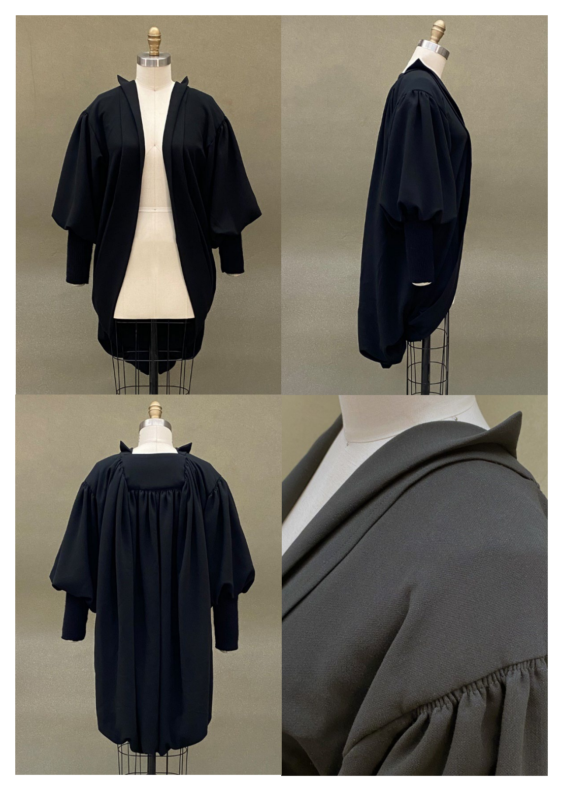
Page 5 of 5