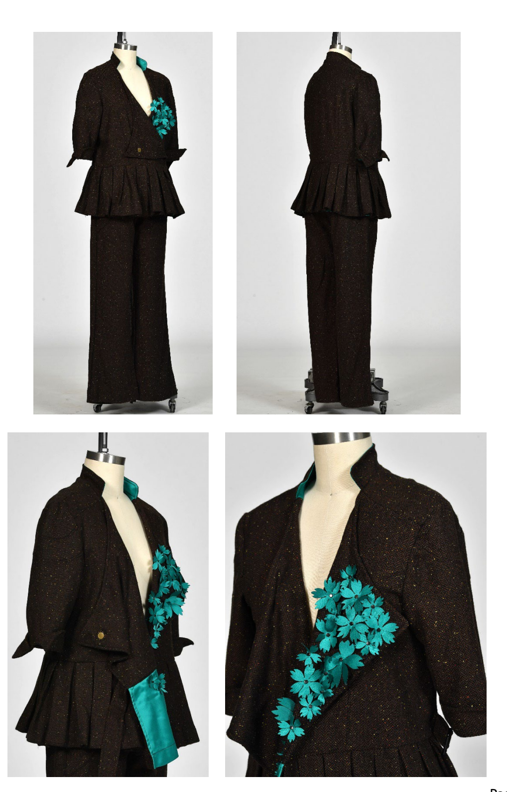
Page 3 of 3

© 2022 The author(s). Published under a Creative Commons Attribution License (<a href="https://creativecommons.org/licenses/by/4.0/">https://creativecommons.org/licenses/by/4.0/</a>), which permits unrestricted use, distribution, and reproduction in any medium, provided the original work is properly cited. ITAA Proceedings, #79 - <a href="https://itaaonline.org">https://itaaonline.org</a>