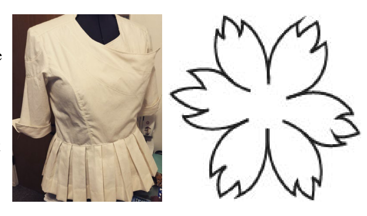
Figure 1: (a) Initial muslin prototype for the jacket, and (b) floral design for laser-cut details.

The pattern for the jacket and pants were created using traditional flat patterning techniques. Once the initial patterns were created, the panels were then cut out and each had ½" seam allowance added. Muslin prototypes were created (Figure 1a) to test fit the patterns. These garments were assembled using overlock and lockstitch machines. Each component of the garment was edge-finished using an overlock stitch and sewn together using a ½" seam allowance, allowing for the ease of repair and alteration in the future. The