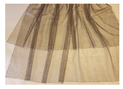
Figure 2 . The 3D printed seamless textile for the skirt

Process, technique, and execution. The design process consisted of six iteration stages: design ideation, 3D lace pattern structure development and testing, 2D pattern development and 3D stimulation, segmenting and 3D modeling, 3D printing, and assembly including trimming of 3D printed panels. The design began with brainstorming of the outfit, consisting of the high waist skirt and the sleeveless vest. Then, the lace patterns of lotus and water lily were developed, and arrangements of the petals were tested and determined. 2D skirt and vest patterns were created, virtually draped, stitched, and adjusted on a size 8 female avatar in CLO; the contour lines of the 2D patterns were exported and then imported into Rhino for segmenting the design and fabricating the 3D model of each panel. Two layers of the 2D vest pattern were segmented into 24 panels and water lily motifs were embedded in each panel with 0.4mm extrusion. For the skirt, a total of 140 panels were segmented and inserted with sacred lotus motifs (see Figure 1). A FDM 3D printer was used to print total 164 panels with black TPU filaments. Figure 2 presents the 3D printed seamless textile for the two-layered gathered skirt. We spent 11 weeks on designing the skirt and the vest, including two weeks of design ideation, four weeks of