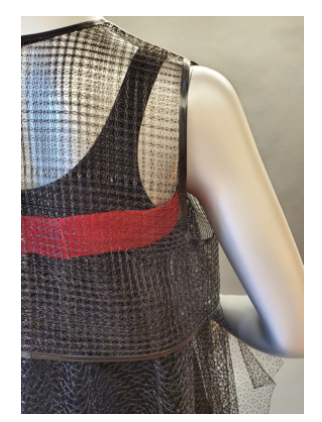
Figure 3. Textile innovation with 3DP

Originality and innovation. This design is original and innovative at (a) developing 3D printed wearable textiles with traditional oriental aesthetics, (b) identifying and applying the seamless adhesive joint method, and (c) integrating novel digital design and manufacturing technologies for developing wearables considering their high drapability when wearing.