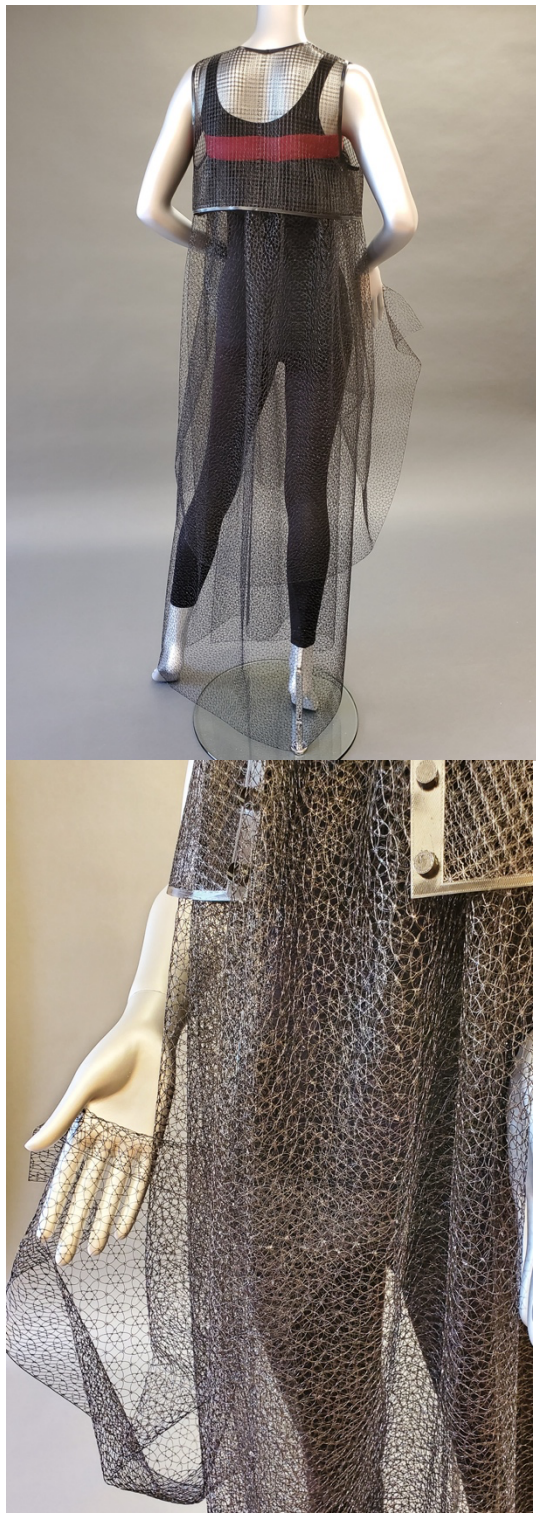
Page 5 of 5

© 2022 The author(s). Published under a Creative Commons Attribution License (<u>https://creativecommons.org/licenses/by/4.0/</u>), which permits unrestricted use, distribution, and reproduction in any medium, provided the original work is properly cited. ITAA Proceedings, #79 - <u>https://itaaonline.org</u>