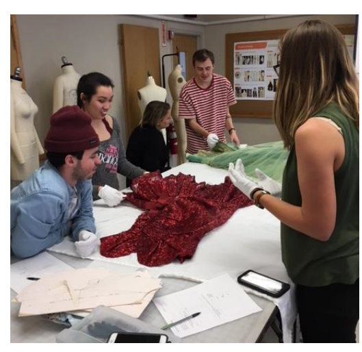
Figure 1 Students examining historic dresses

The historic dress active learning assignment was conducted before students began draping their own strapless dress designs. First information regarding the internal structure of evening-wear including lining, underlining, boning, waist stays, and other elements that can be used to support a garment's shape was presented to students in a PPT lecture. Numerous pictorial examples were included in the lecture. In the next class period, the historic collection staff brought four strapless dresses from the time period 1980s to 1990s. These artifacts were selected for their variety of