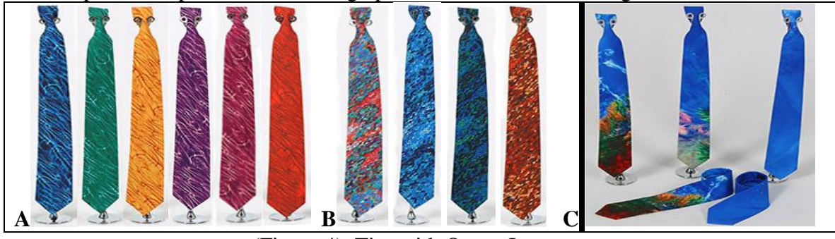
(Figure 4). Ties with Ocean Images