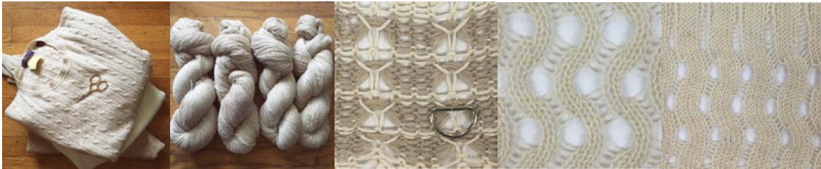
Figure 1. A sustainable design process of the project