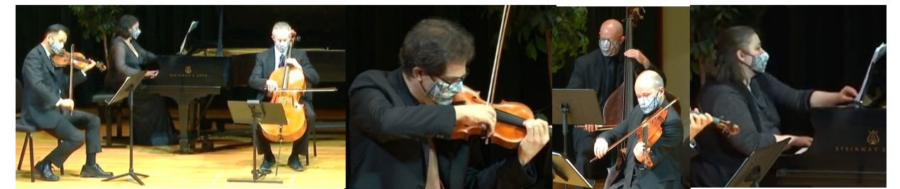
Figure 2. Images from the concert, showing all seven musicians during the first act.

Variations of Cubism-inspired strokes as surface design, using thick, textured embroidered lines over the faceted and shaded faces in the digital print, gave different identities and dramatic expressions to each mask. The seven colors of rainbow were mixed in the first set of masks, and for the second set, each mask had only one colored line along with a neutral metallic threads color story. The resulting designs have a formality and dynamic cohesive with an impromptu rhapsody. As the camera focused on each player during the virtual performance, the subtle differences between the masks became noticeable, conferring each player the sought individuality and expression. The bright, colorful embroidered lines created impact and excitement in the first act, while the sparkling metallic embroidery lines hinted to a touch of fashion glamour in the second act (the images on the last page show four different masks, three from set one and one from set two). The black under-chin panels maintained the masks in their place during the performance, without the need of adjusting, and they were barely visible. The mask design also functioned well for the violin player that had glasses and for the lead player that had to speak and introduce the septet (Figure 2).