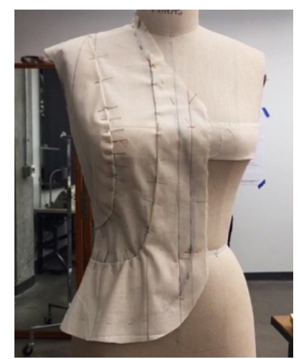
Figure 1: Draping, patternmaking

The silhouette of the jacket was developed using a traditional draping process on the dress form to create the contoured, elegant shape. (Figure 1) A pattern was created from this drape, then digitized to complete the development digitally. At this step, without access to a professional digitizing tool an alternative was necessary. The researcher used knowledge of patternmaking and shape along with photos and measurements to transfer the pattern to an Adobe Illustrator file. Using this digital file, the pattern was cut from muslin and sewn to check the fit. Several needed modifications were easily conducted in illustrator before moving on to apply the lace design.