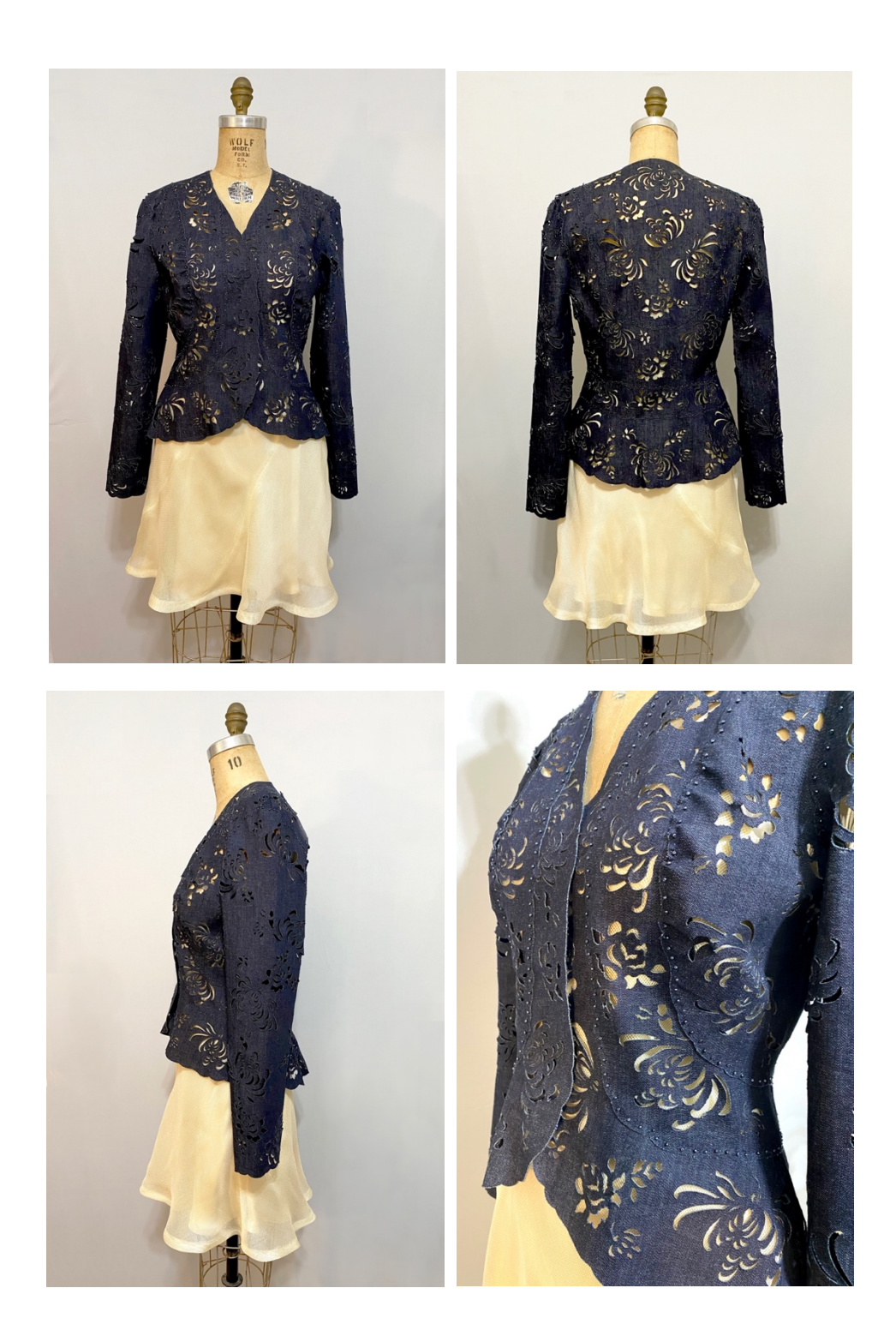
Page 4 of 4