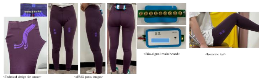
Figure 1. Pants for the measurement of sEMG

The Size Korea body size of women's in early 20s used to construct the two nude size pattern of compression pants and one pattern was reduced horizontally 10% while the other pattern was reduced horizontally 25%. The bipolar textile electrodes were marked on positions of quadriceps femoris and biceps femoris of hamstring onto the pattern, and then it was embroidered with conductive threads after cutting the fabric. In addition, 9 channel signals were collected through the embroidered ground electrodes located on the inside of the middle back waist belt. The tricot knit with 4-way stretch was used, and electrodes and circuit were stitched using stainless steel threads for the textiles electrodes. Also, PU seam sealing tape was applied to reduce the resistance of the circuit as shown in Figure 1.