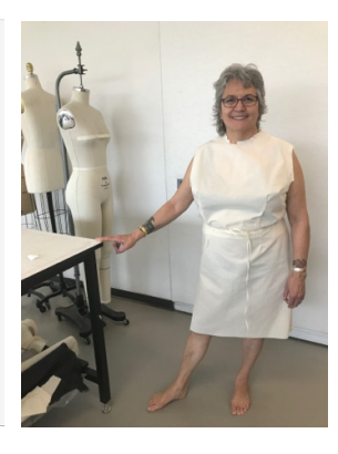
Figure 1 (left): Body scan of Naasquuisaqs. Figure 2 (center): Cross-sections of body scan and dowel registration marks for half-scale dress form production. Figure 3 (far left): Naasquuisaqs in basic sloper muslin developed from custom half-scale form