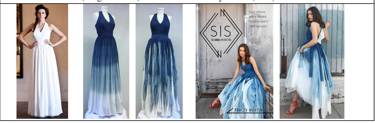
Figure 2. Halter Gown Original (image 1), Ombre Dyed Dress with Overskirt (images 2, 3), and Book Cover Front and Back (images 4 and 5). Permission for use by Martin (2017).

Contributions. Working with three brands of indigo to maintain fermentation fructose vats contributes to the understanding and growing interest in such vats. We found a brand that works well in our lab and will continue to explore long-term vat maintenance. Dyeing an already constructed gown versus fabric pieces created challenges with managing bulk and preserving undyed and dyed sections. Utilizing plastic wrap, bags, and sheeting secured with rubber bands and string builds upon the application of capping as a method to resist dye.